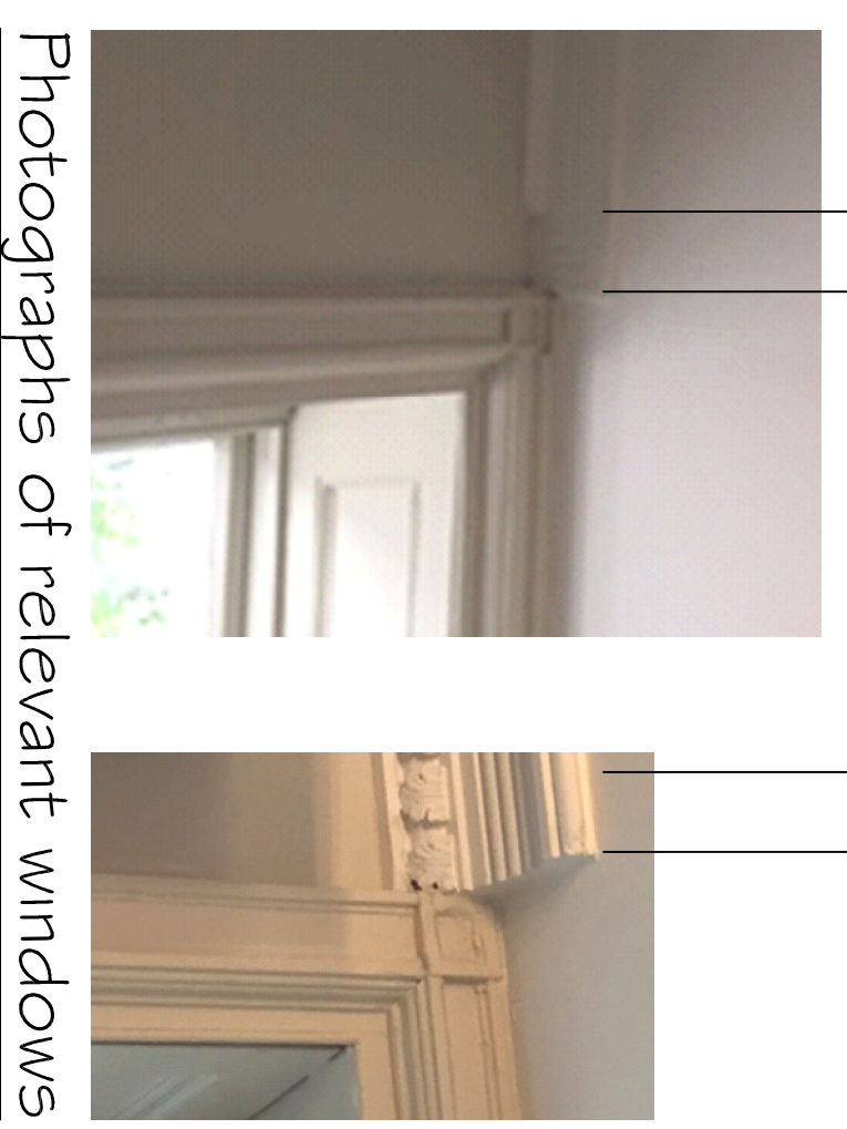
Photographs of relevant windows