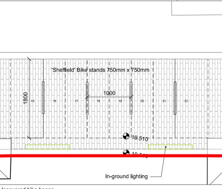
Cycle Stores Plan 04 606-17000B