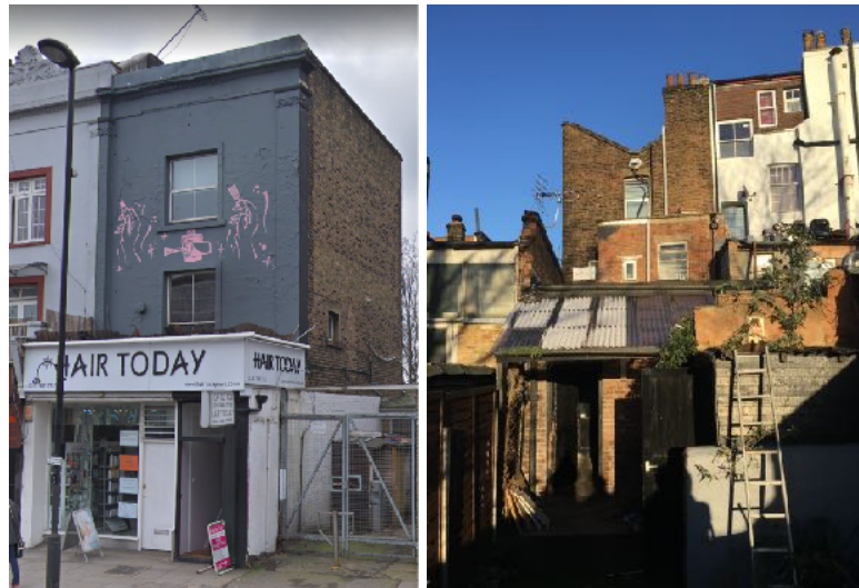
Figure 2 - The front and rear of the premises