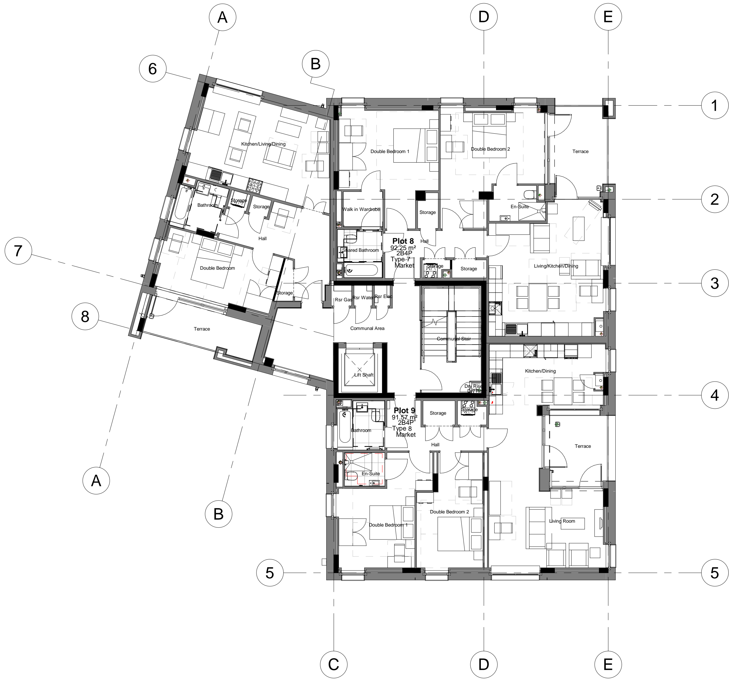
Second Floor Plan 1 : 100