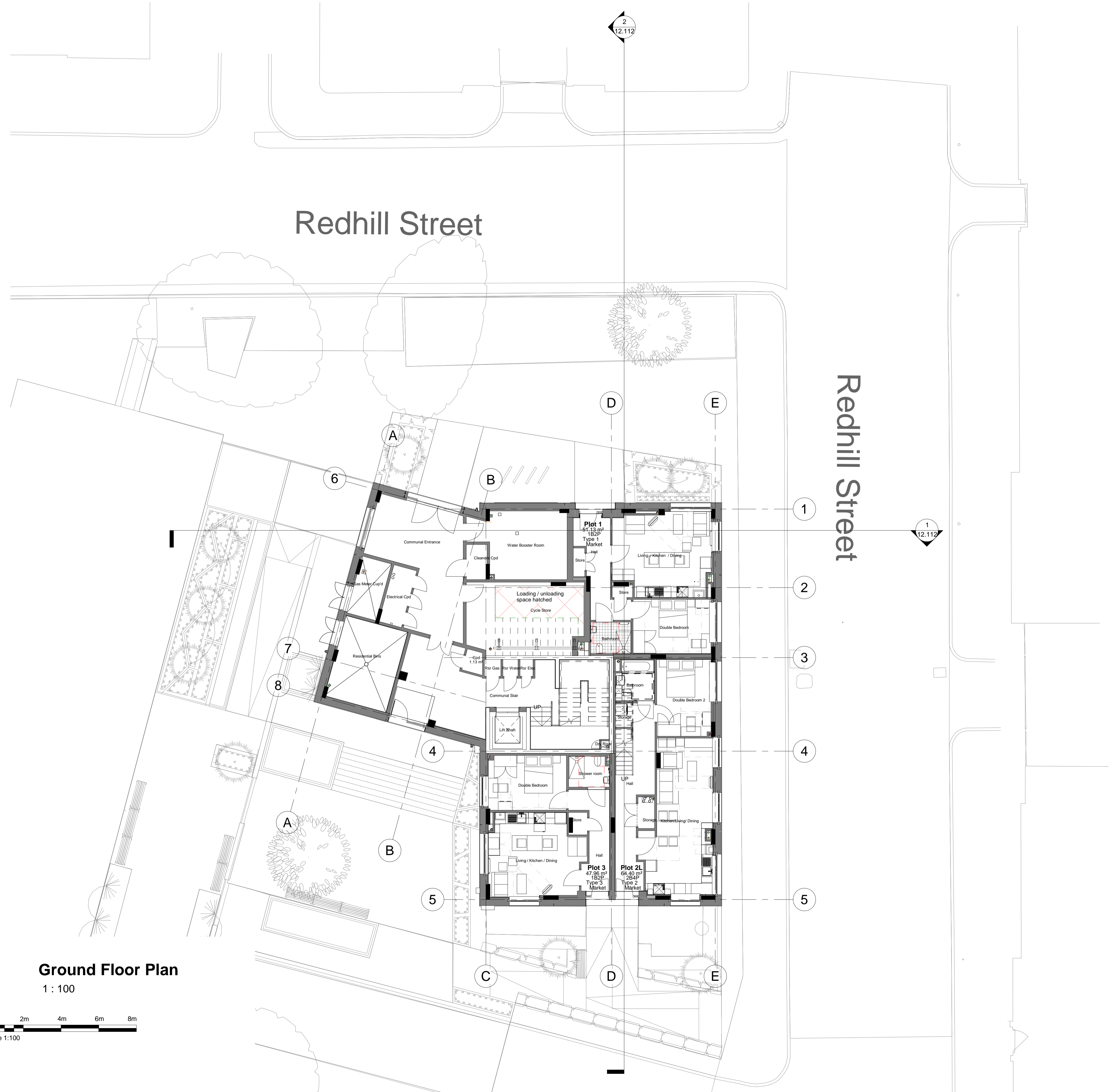
Ground Floor Plan 1 : 100