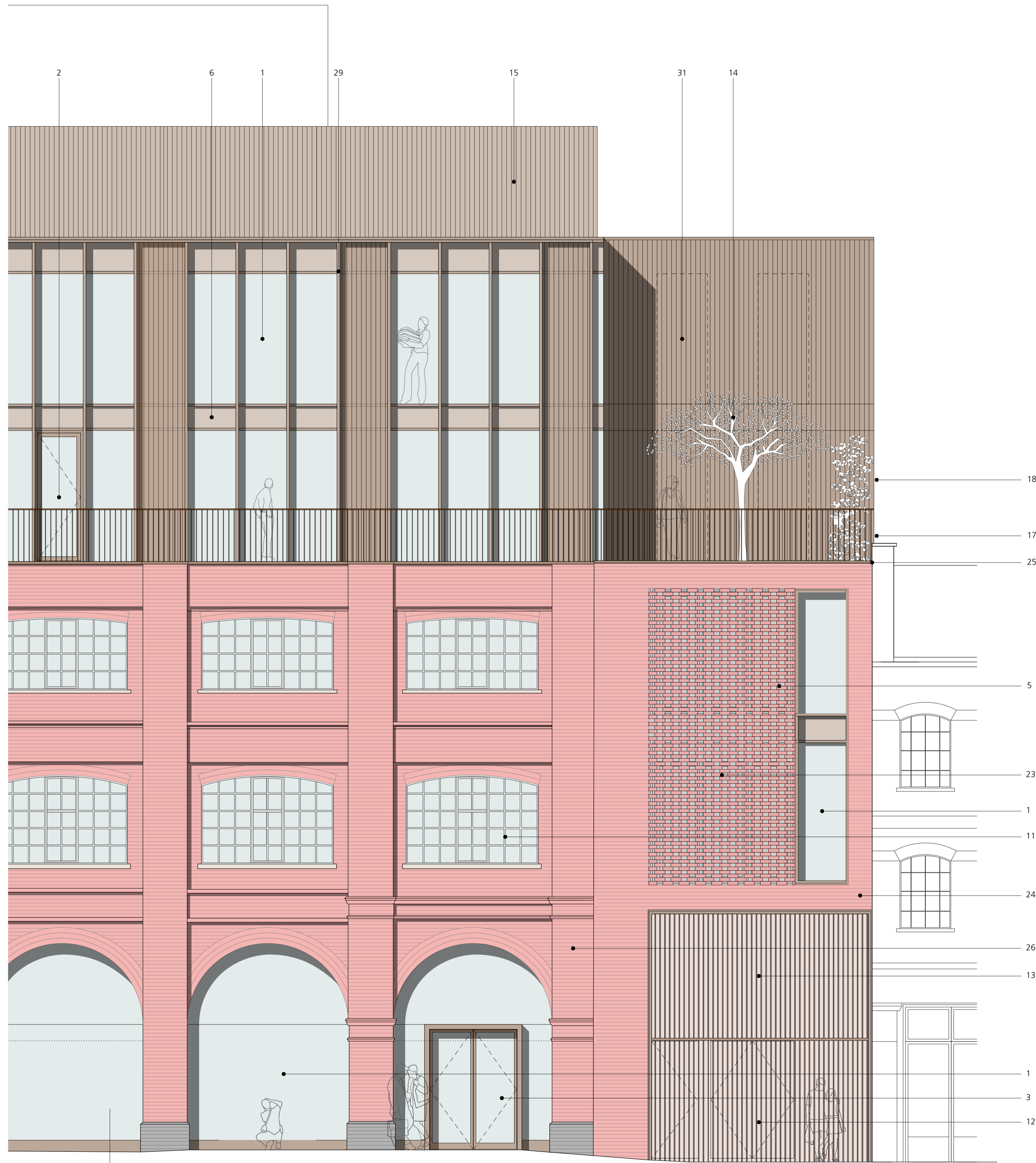
1 Short's Gardens Elevation