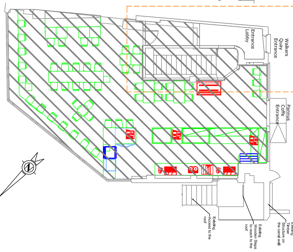
02 Ground Floor - Existing Scale: 1:100 METER