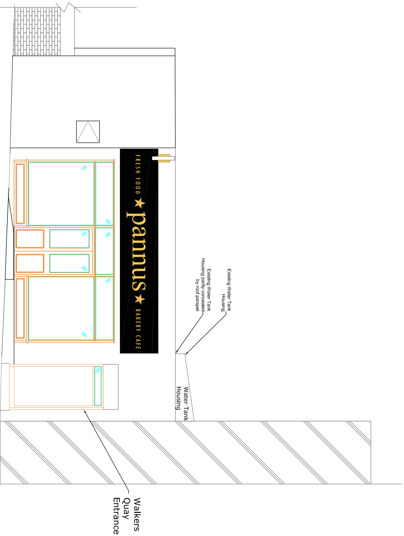
01 Shopfront Elevation - Proposed Scale 1:50