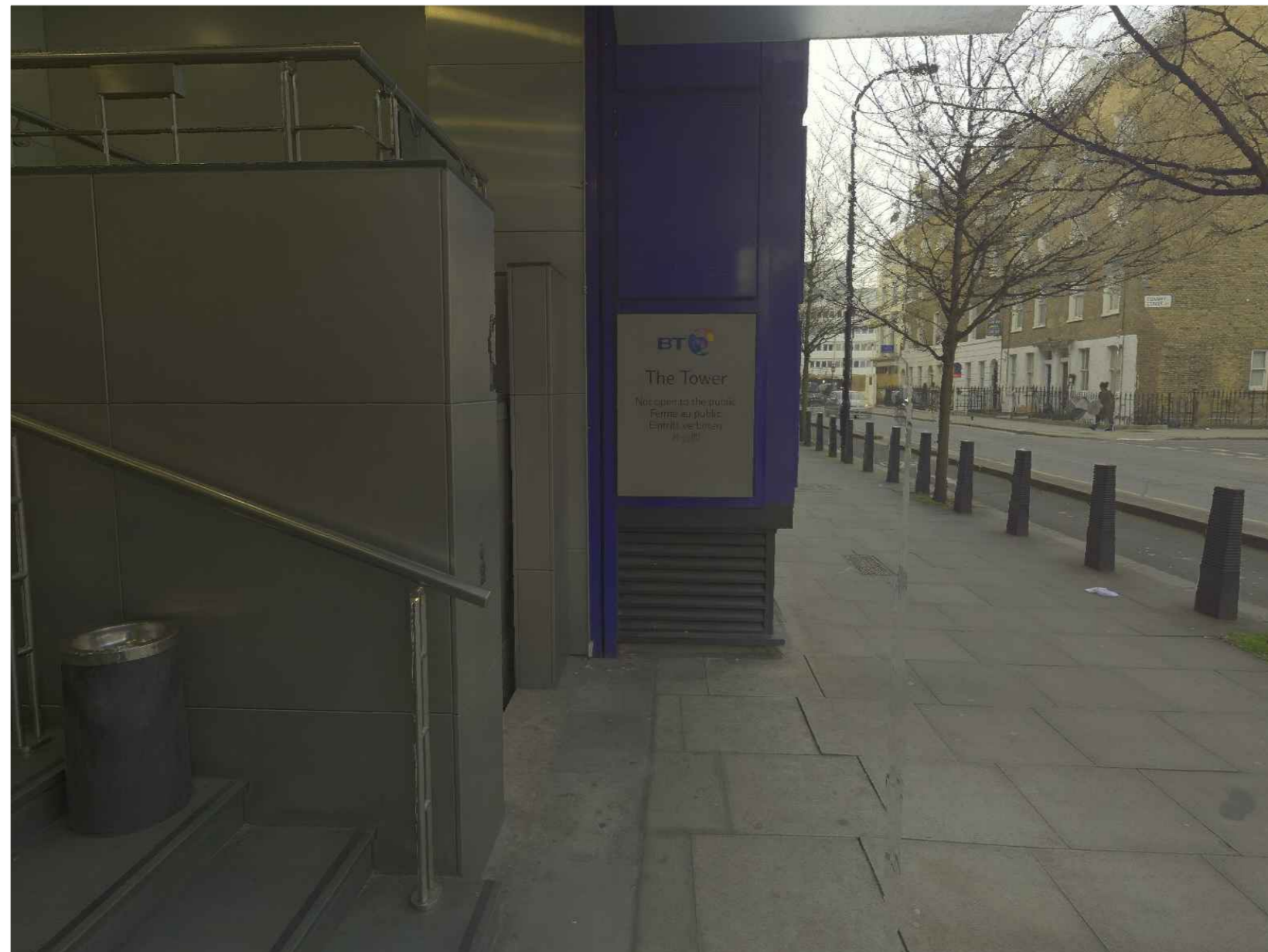
EXISTING MAPLE STREET