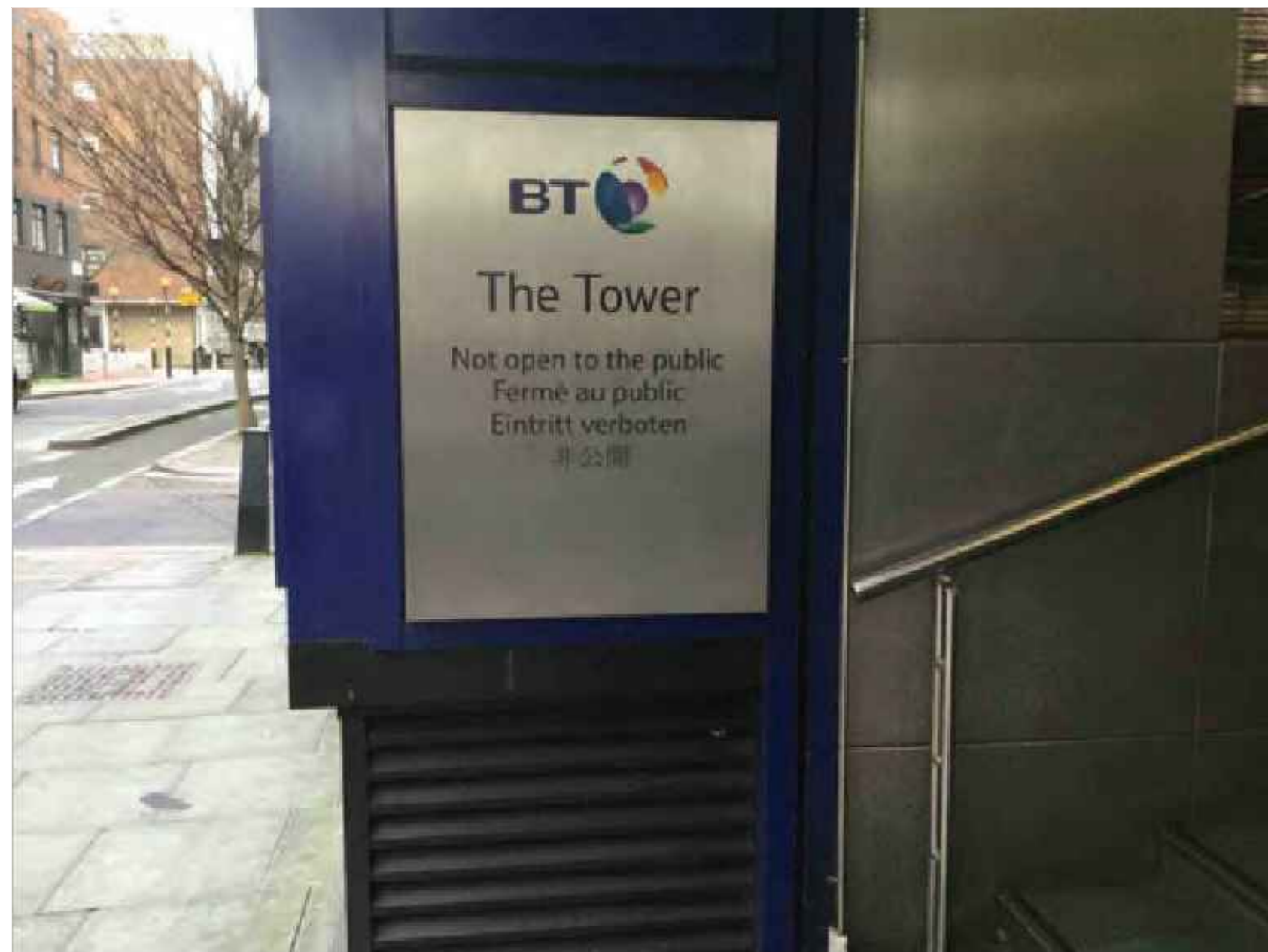
EXISTING MAPLE STREET