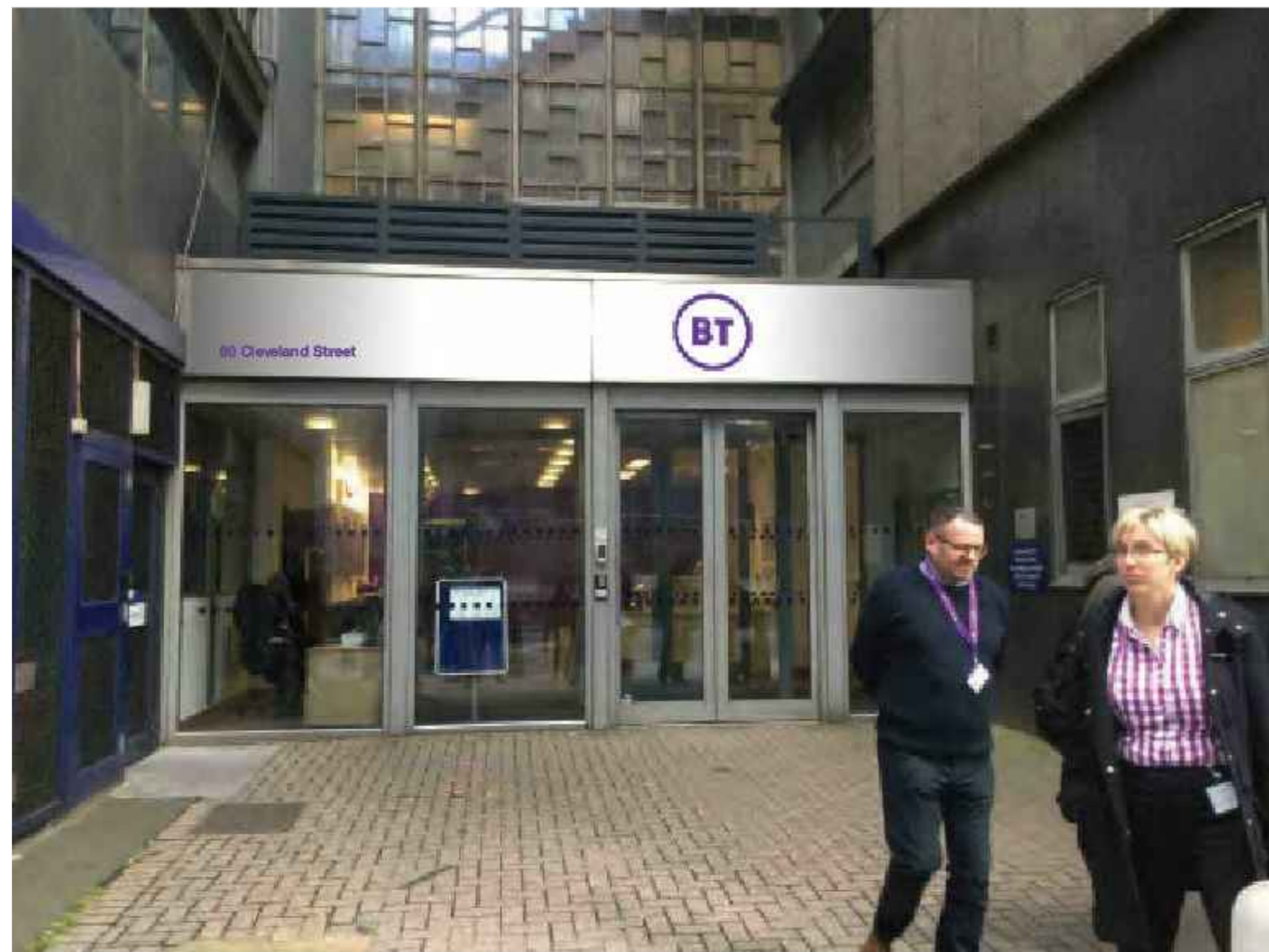
PROPOSED CLEVELAND STREET

Scale 1:200 0 1m 2m 3m 4m 5m 6m 7m 8m 9m 10m