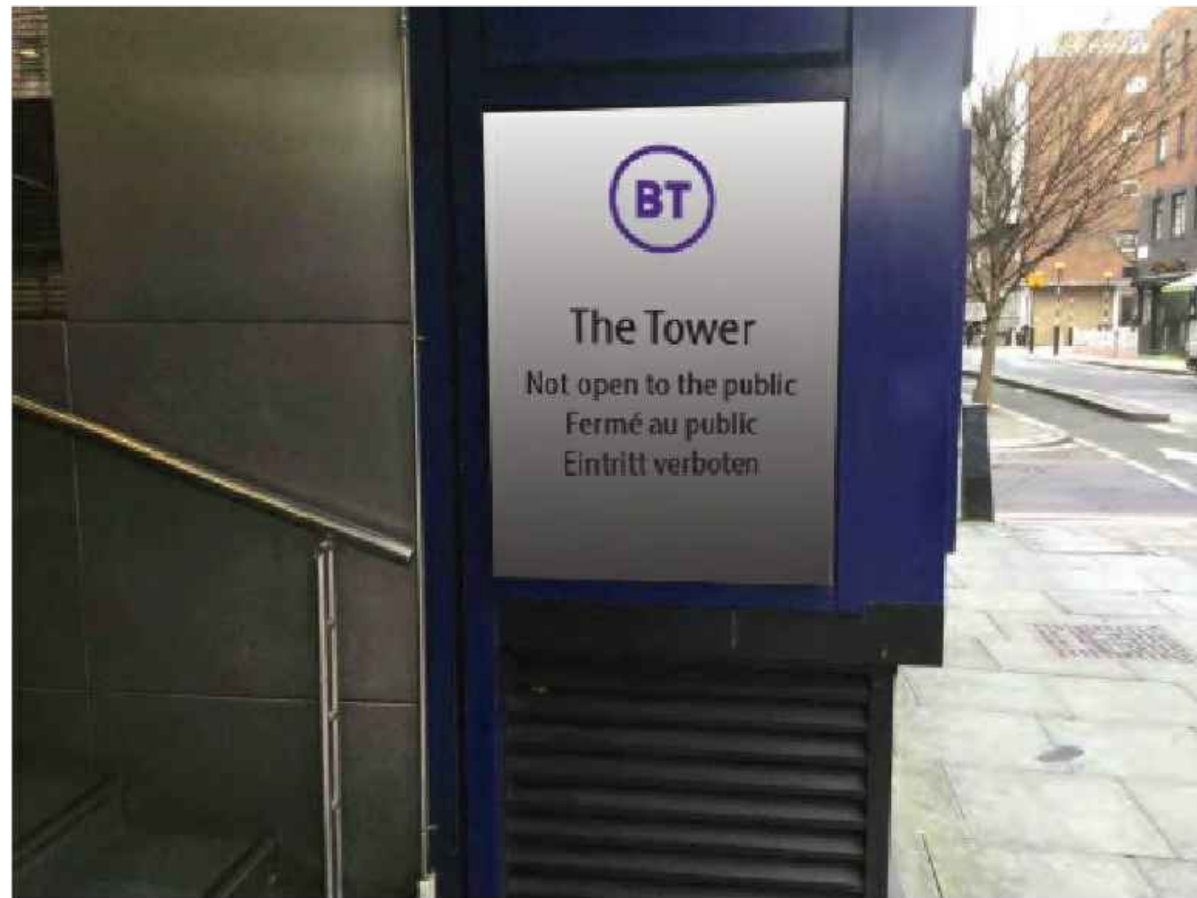
EXISTING MAPLE STREET