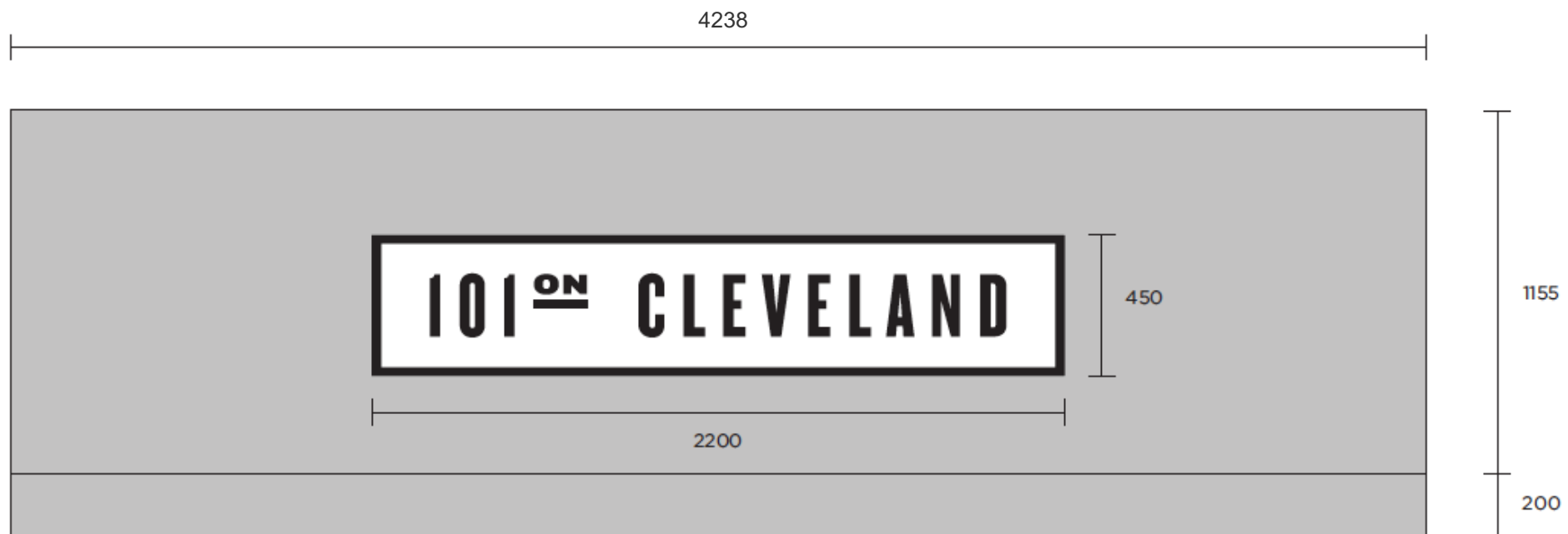
Awning Font: Knockout – HTF67 FullBantamwt, Text size 200mm : Black text on white background.