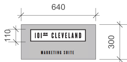
Projecting sign Font: Knockout – HTF67 FullBantamwt, Text size 50mm : Black text on white background, projecting signage not to be illuminated.