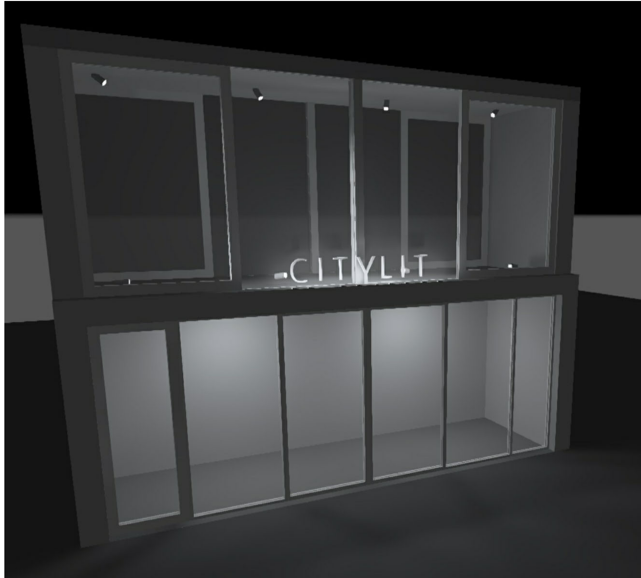
Proposed signage lighting study