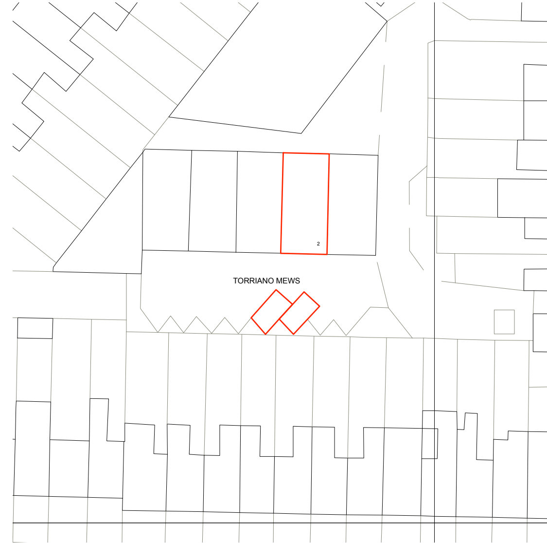
SITE LOCATION PLAN SCALE: 1:500 @ A3