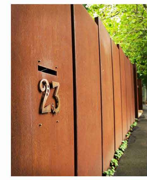
Cor-ten Steel Palisade