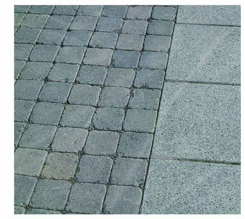
H.Q. Printed Concrete (dark and light)

Scale 1: 150@A1, 300@A3 Date May 2018 Drawn LV Checked Drawing No. 181130-A(LA)001 Rev. CAD plot date: 16 May 2019 - 09:01am