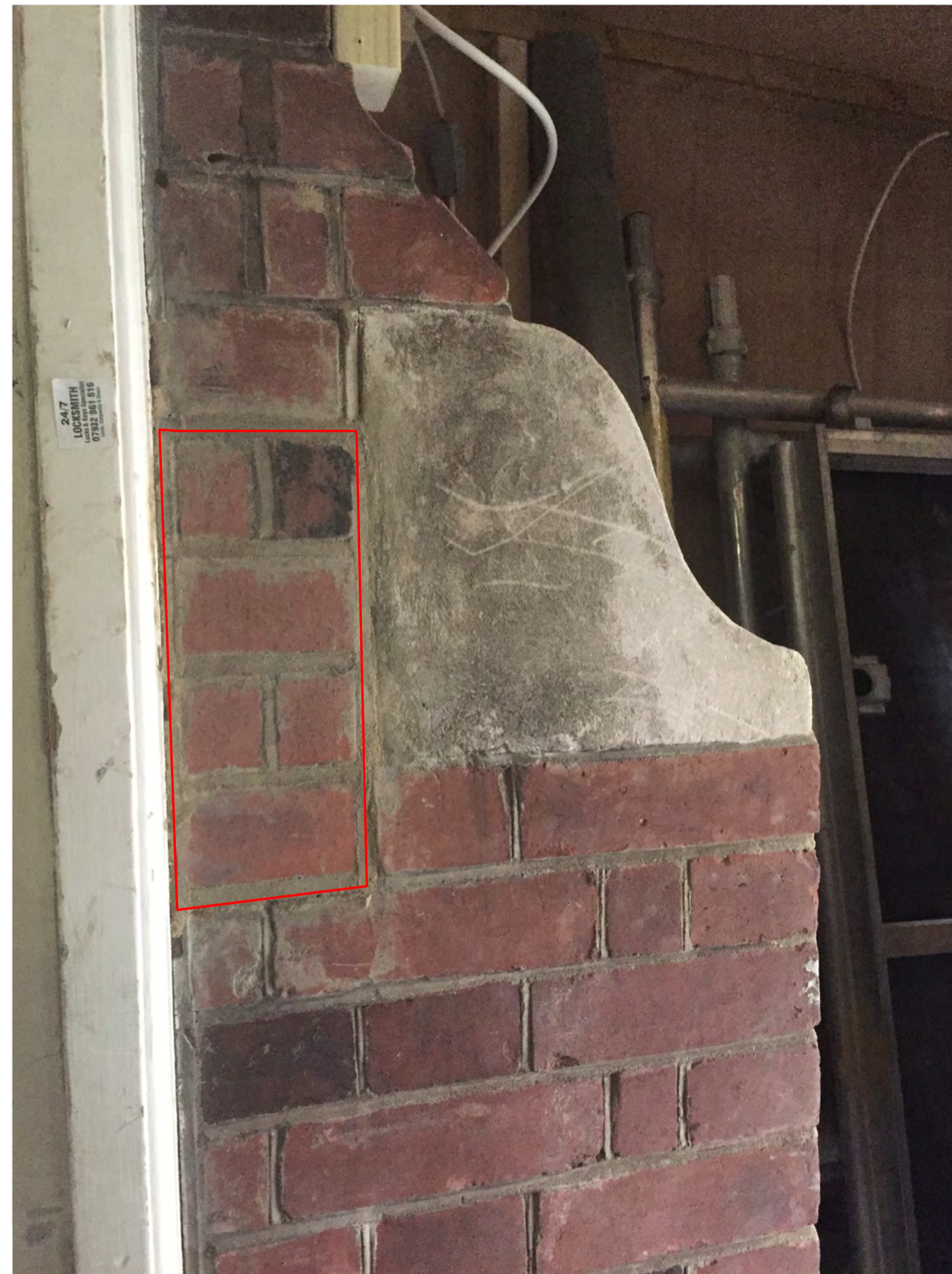
Picture 1 Evidence of previous entrance system. Repointing has been done with cement mortar and bricks are not matching the originals in the infill