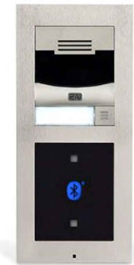
Proposed entry system