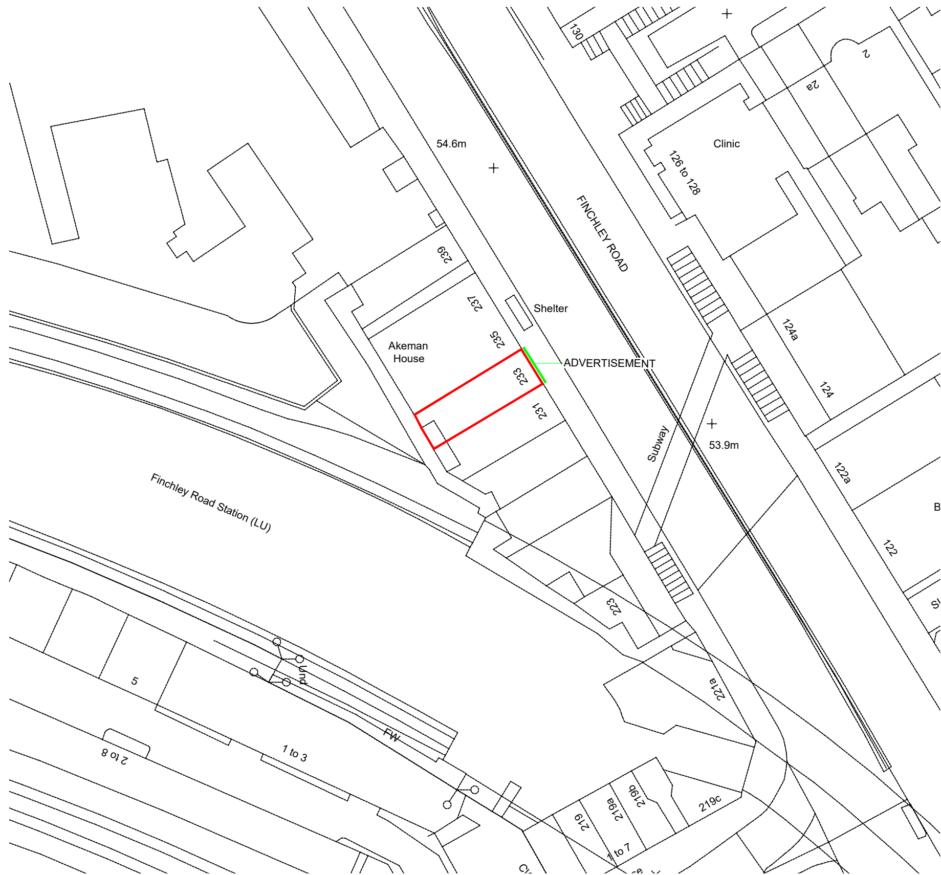
S I T E P L A N

Scale in Metres for 1:500 @ A3 0 5 10 15 20 25