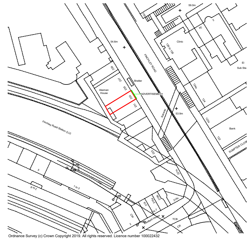
L O C A T I O N P L A N

Scale in Metres for 1:500 @ A3 0 5 10 15 20 25