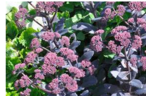
Sedum 'Jose Aubergine'