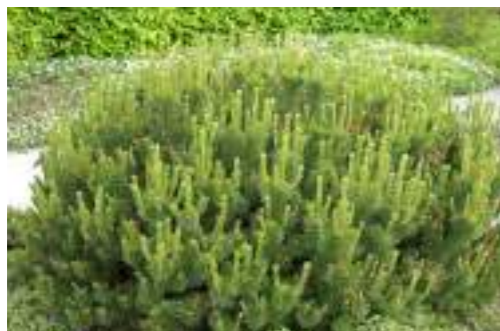
Pinus mugo 'Pimilio'