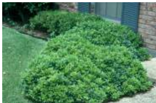
Pittosporum tobira 'Nana'