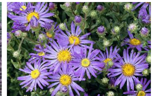
Aster amellus 'King George'