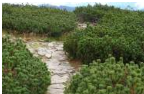
Pinus mugo 'Pimilio'