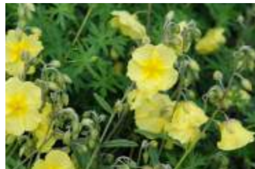
Helianthemum 'Wisley Primrose'