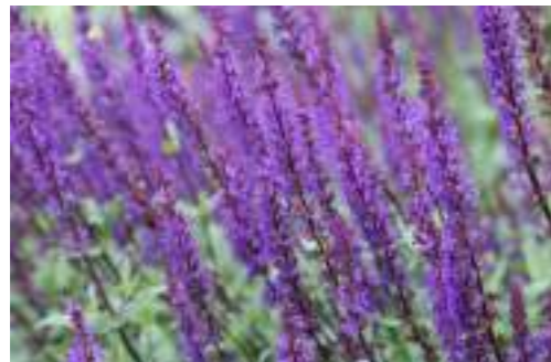
Salvia nemorosa 'Caradonna'