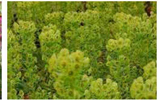
Euphorbia 'Humpty Dumpty'