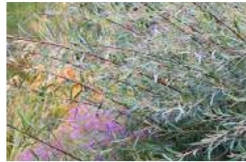
Salix purpurea 'Nancy Saunders'