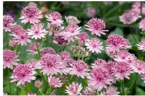
Astartia 'Roma' AGM