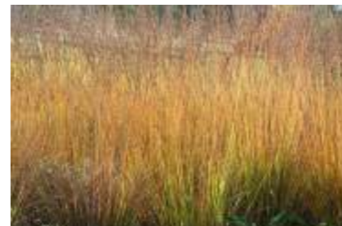
Molinia caerulea 'Moorhexe'