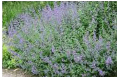
Nepeta 'Walker's Low'