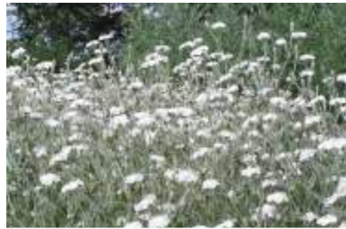
Lychnis coronaria 'Alba'