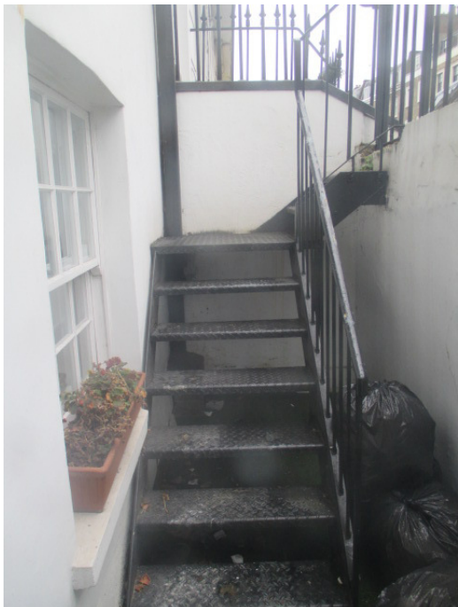
Front area steps