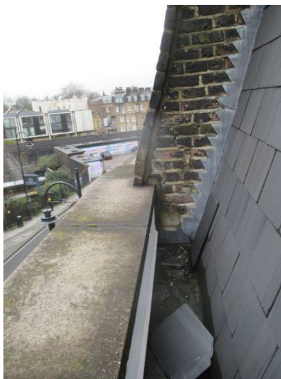
mansard roof front

generally in good condition as it appears to have been completely replaced in the refurbishment.