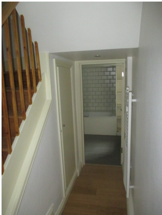
Hall towards bathroom