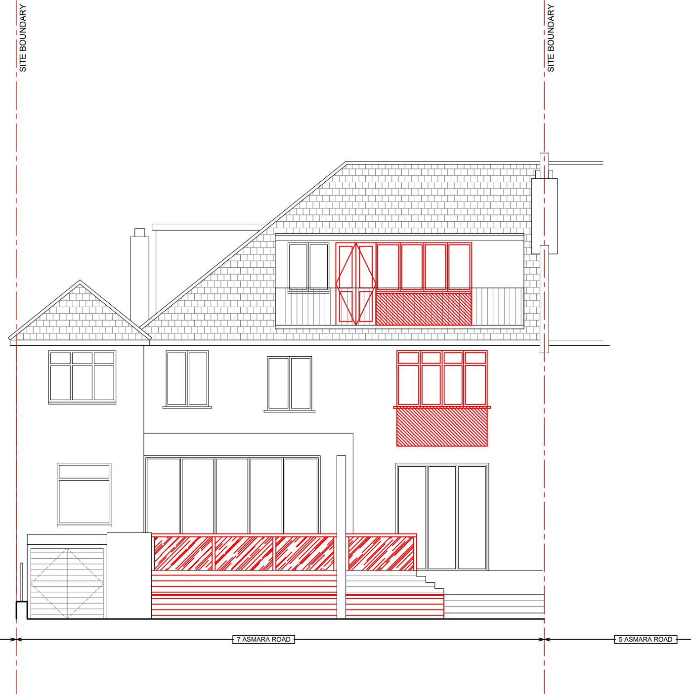
1 DEMOLITION BACK ELEVATION_ SCALE 1:100 @ A3