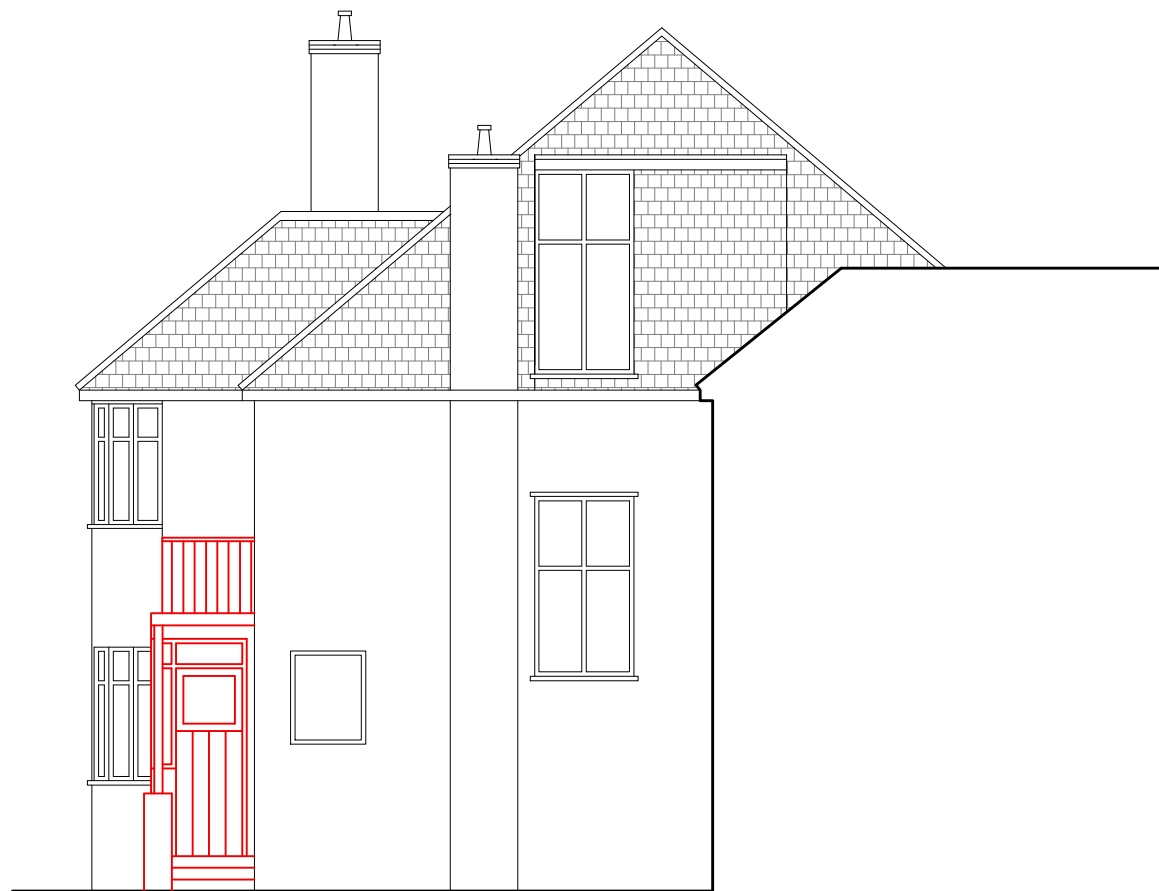
1 DEMOLITION SIDE ELEVATION_ SCALE 1:100 @ A3