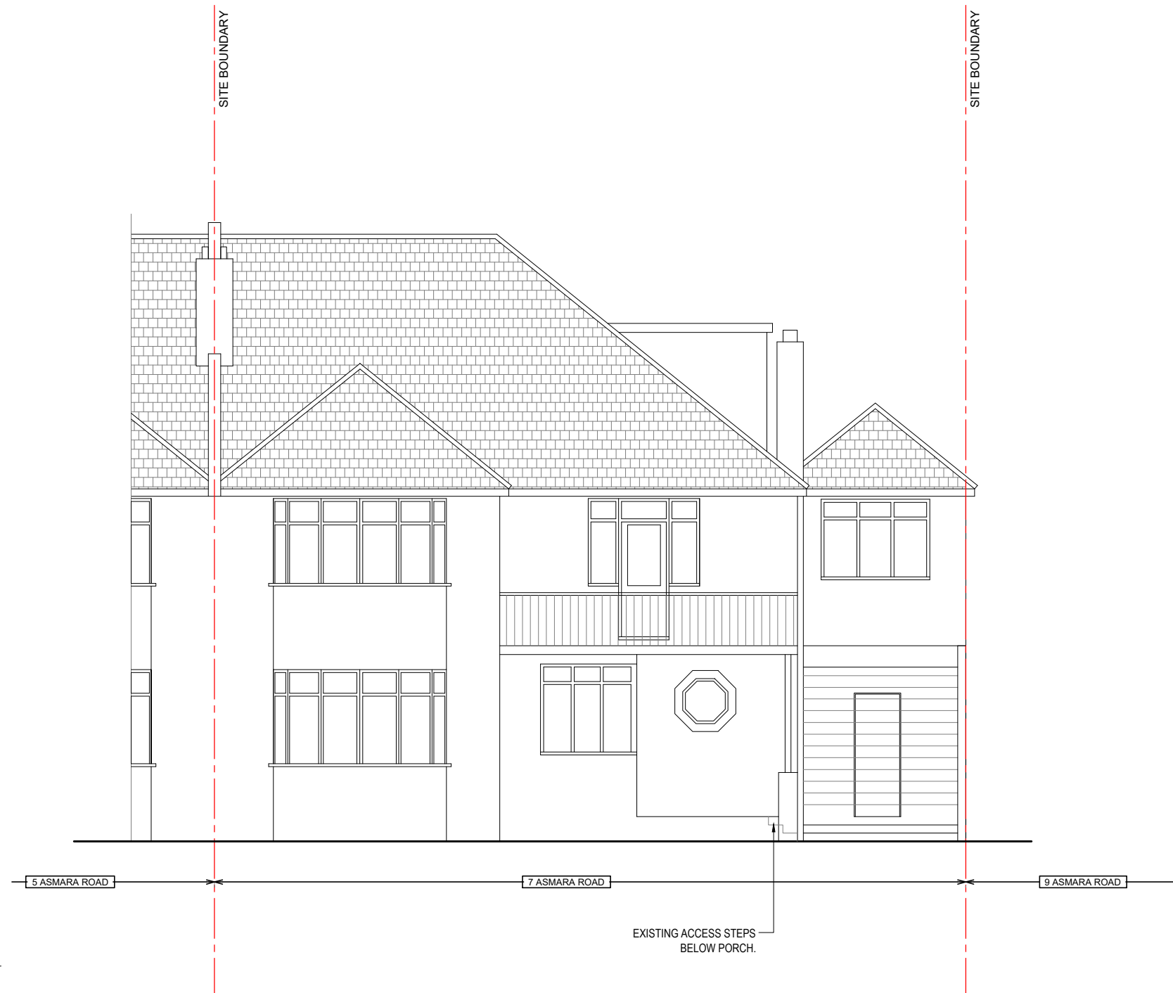
1 EXISTING FRONT ELEVATION_ SCALE 1:100 @ A3