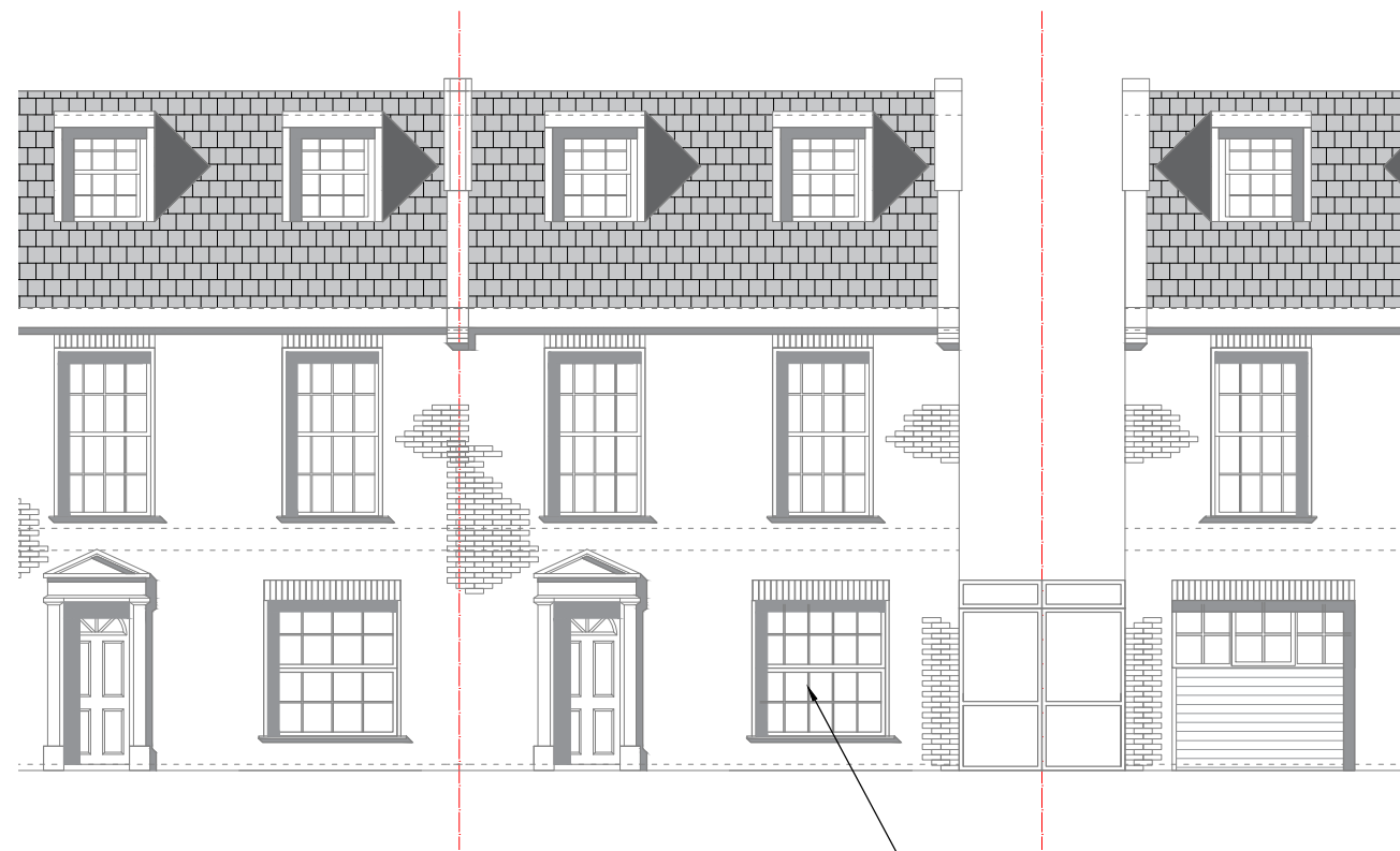
050.1 FRONT ELEVATION AS PROPOSED

New sash window to match style and frame to the existing windows.