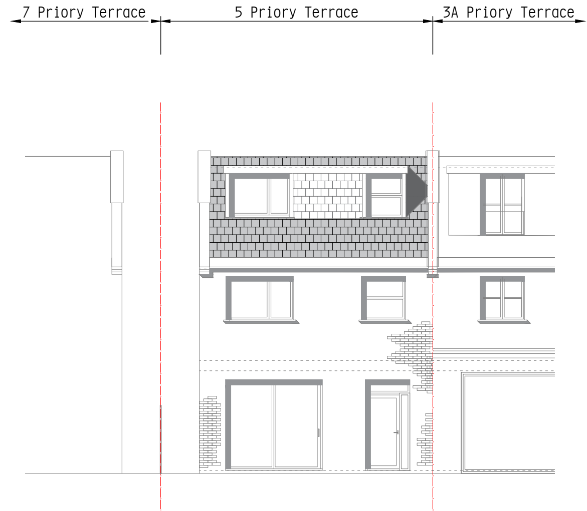
050.2 REAR ELEVATION AS EXISTING