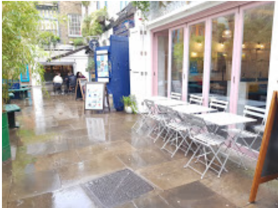
example photo by client, showing distance from adjacent existing planter, verified on site to be more than 1.8m

Note: Neal's Yard is a pedestrian space with no roads or kerbs