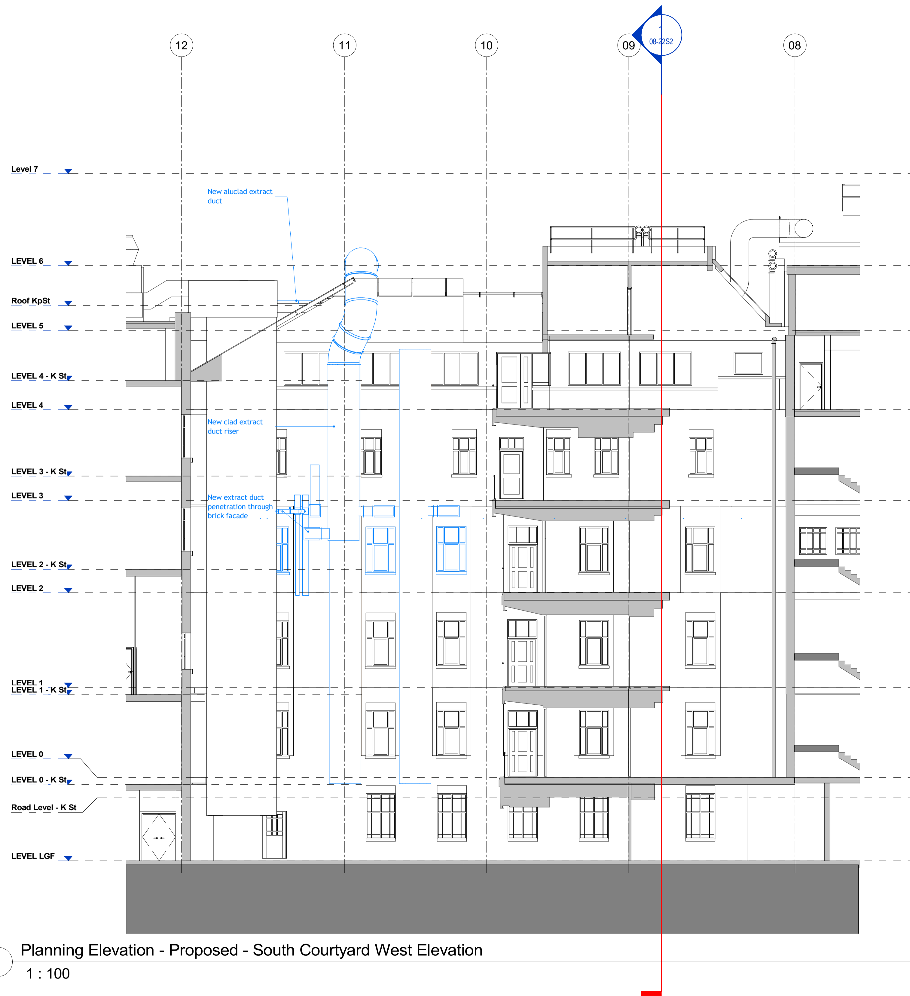
1 Planning Elevation - Proposed - South Courtyard West Elevation 1 : 100

DO NOT SCALE THIS DRAWING IS © IAN RITCHIE ARCHITECTS LTD Dimensions to be verified on site. Figured dimensions to take preference to those scaled. All discrepancies to be clarified with the project Architect. Unless otherwise stated all levels to be AOD. This drawing is the property of Ian Ritchie Architects Ltd. and is issued on the condition it is not reproduced, retained or disclosed to any unauthorised person, either wholly or in part without written consent.