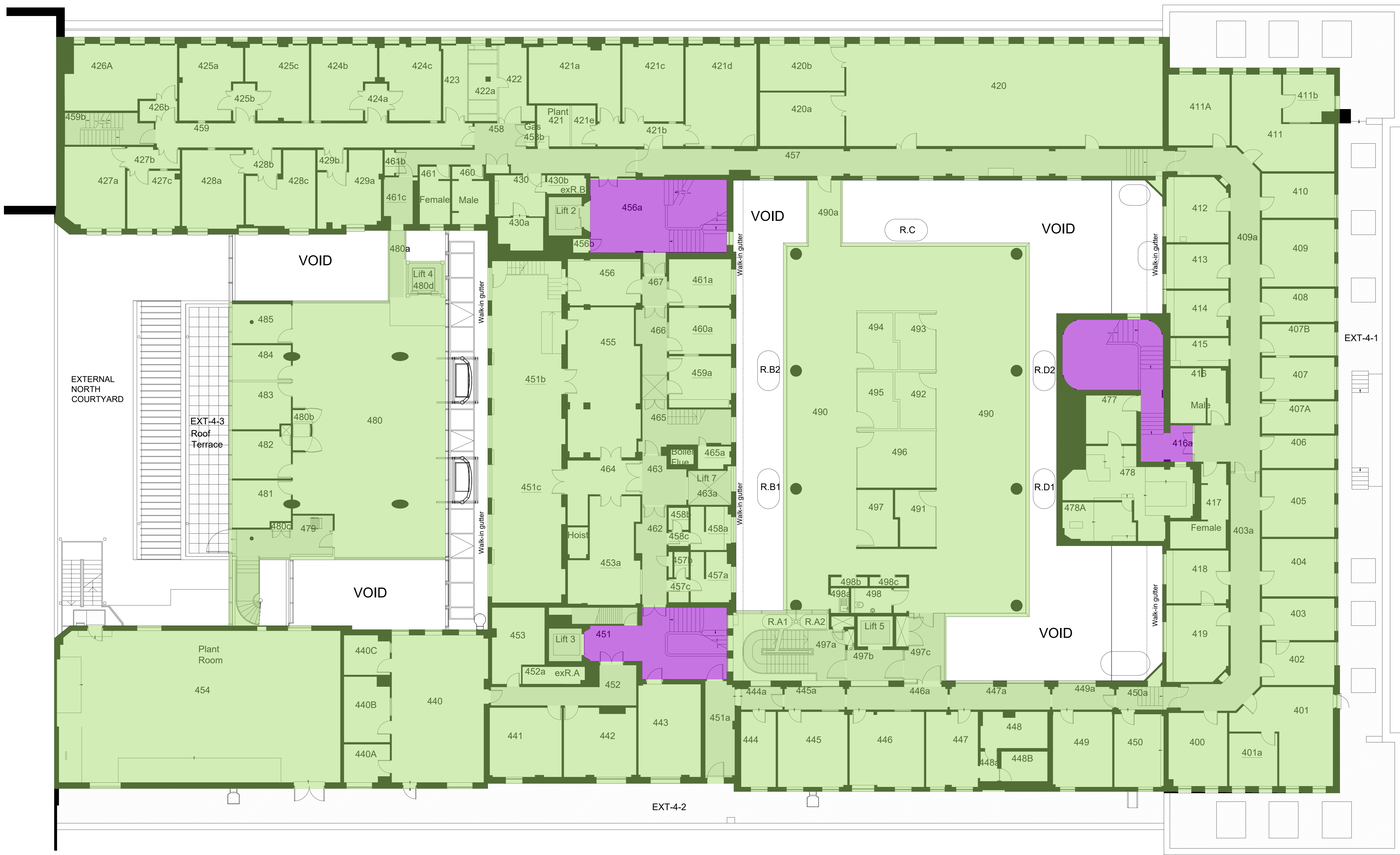
01 Level 04 - Plan - Conservation Strategy 08-2034 Scale = 1:100