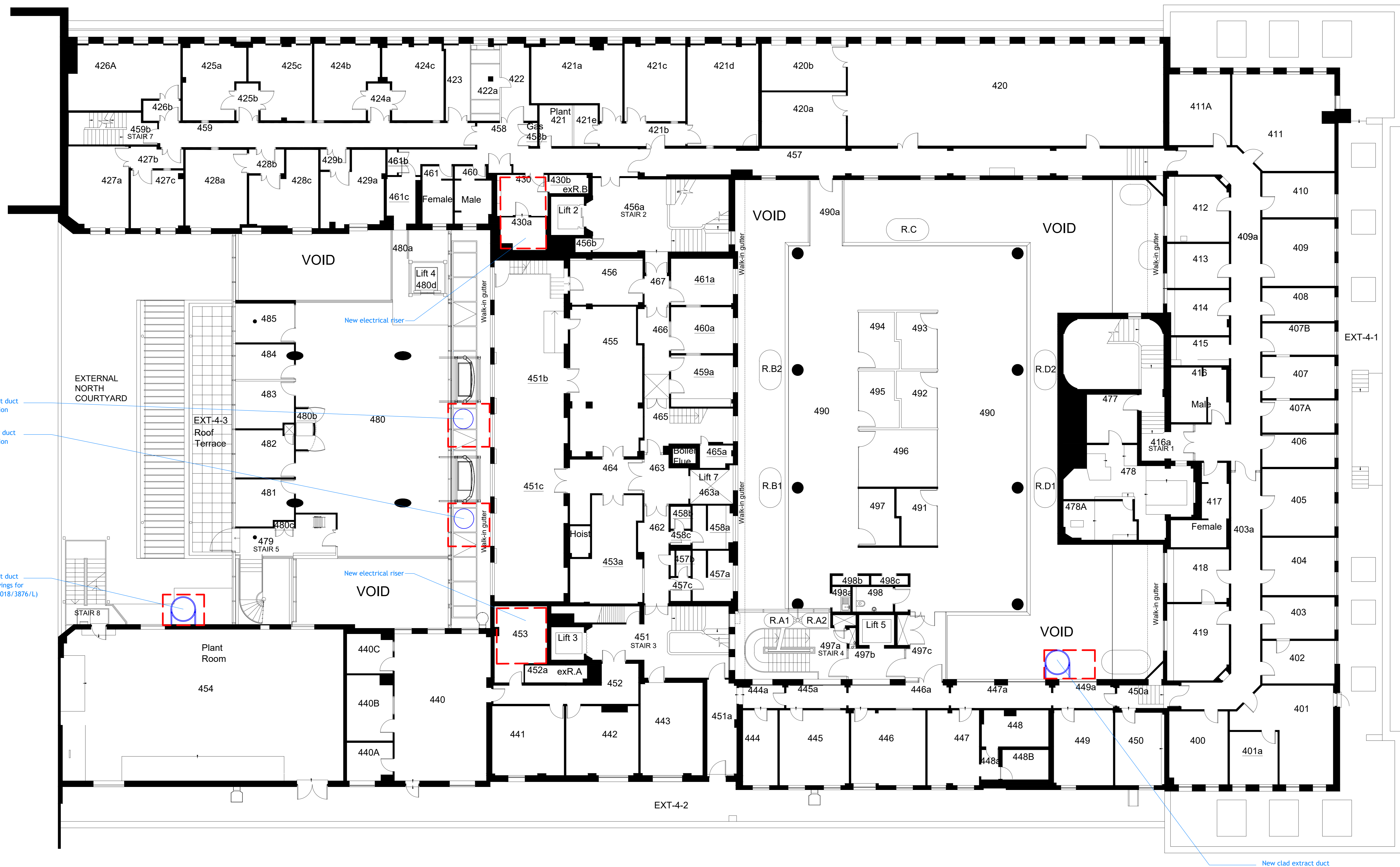
01 Existing Level 04 Plan 08-2004 Scale = 1:100

KEY: — Existing — Proposed - - Site Boundary (at this level) Phase 2b / 2c Works