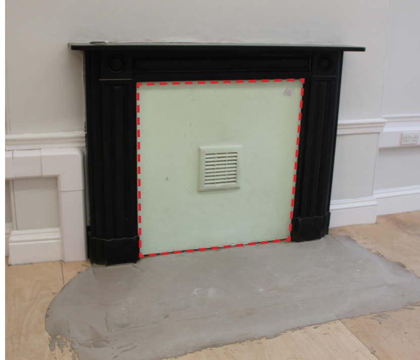
9MS/2/001 - AS BUILT CONDITION

If uncovered, we would suggest that the chimneys are swept, a ventilated cap is fitted to the chimney if not already present, and an inflatable device is fitted at the base of the chimney to prevent draughts and dirt from entering the rooms.