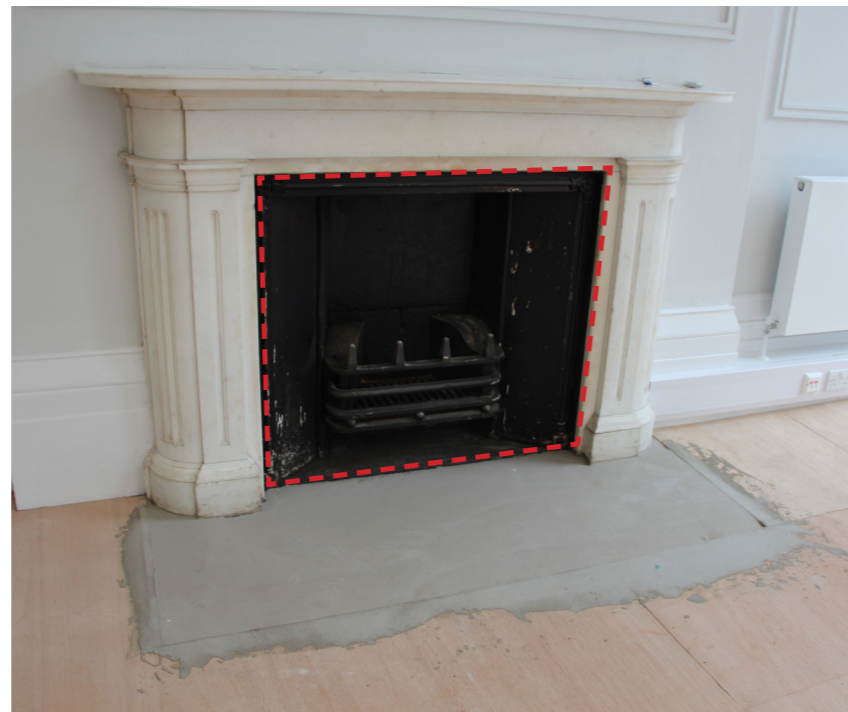
9MS/3/001 - AS BUILT CONDITION