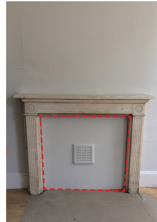
11MS/2/001 - AS BUILT CONDITION