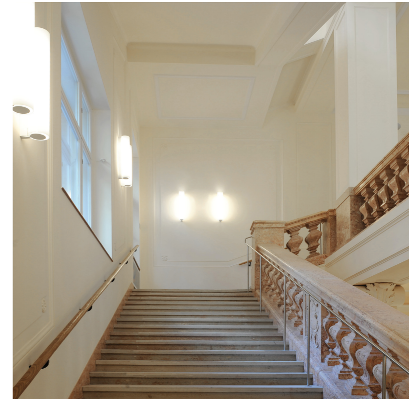
GLASHUTTE LIMBURG LIGHTING - STUBENRING, VIENNA