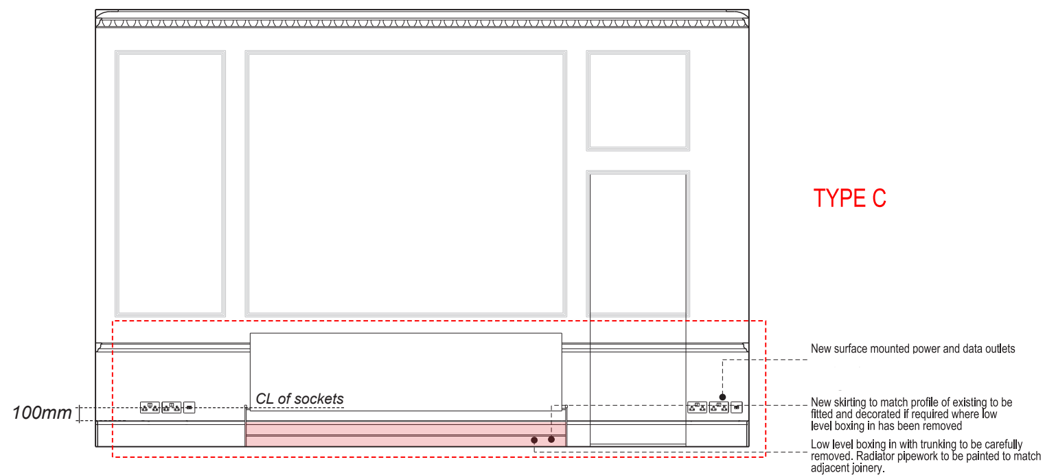
11MS/2/004 South Elevation Additional Works Type C