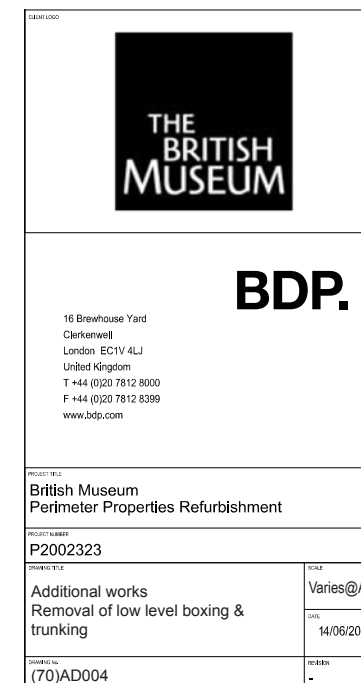
11MS/2/004 - Key Plan