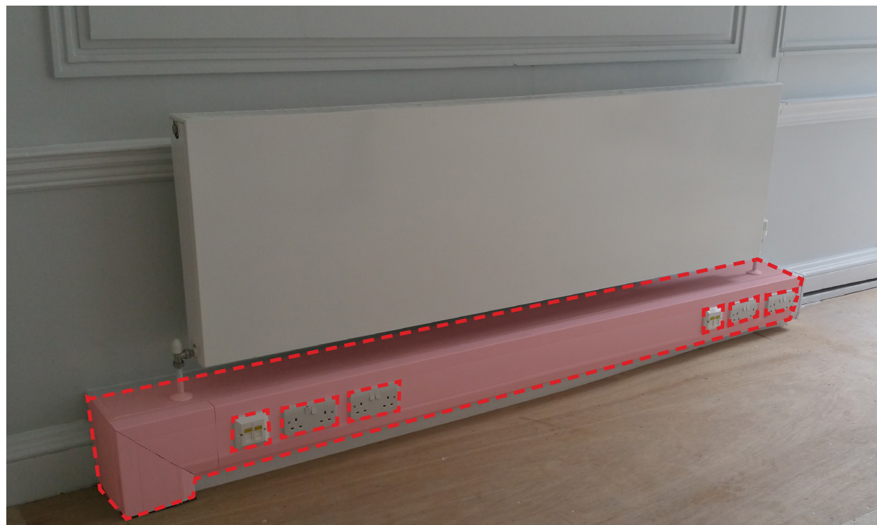
South Elevation - Type C