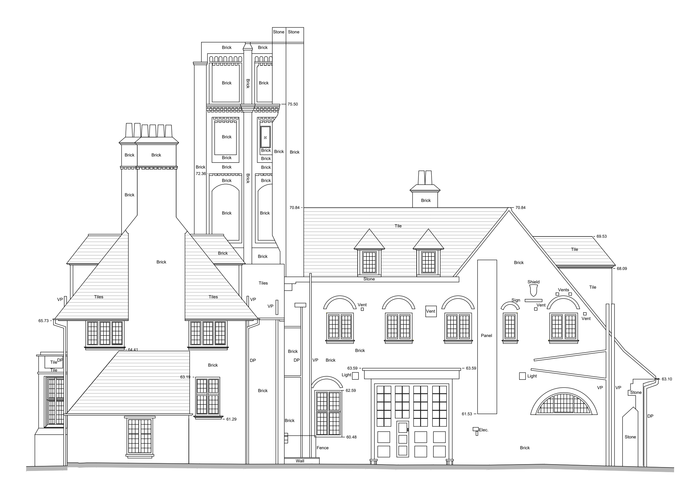
APPROVED EAST ELEVATION