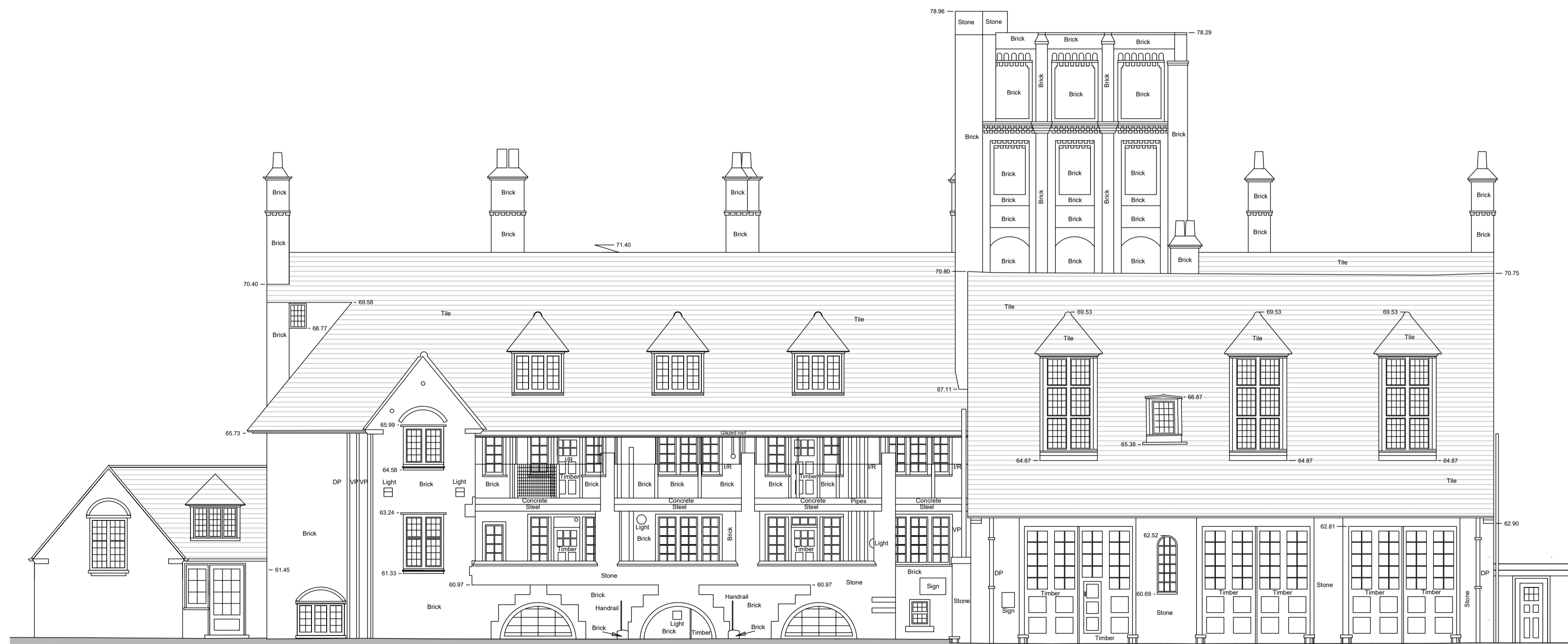
APPROVED NORTH ELEVATION