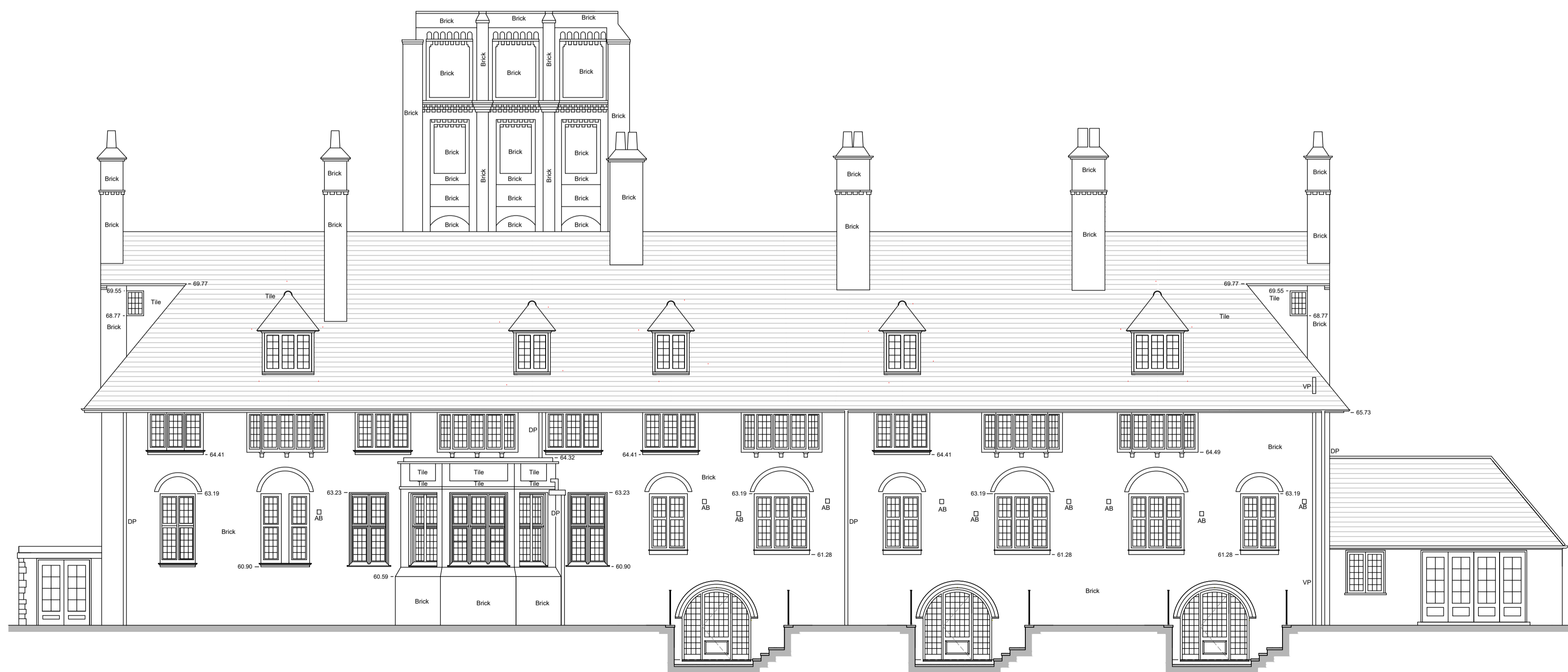
APPROVED SOUTH ELEVATION