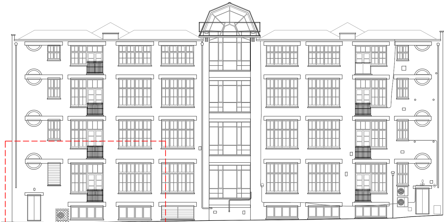
NORTH WEST (PERCY MEWS) ELEVATION 1:200@A3

NOTES: LOCATION PLAN @ 1:1250 and NORTH UP ALL SCALES/DIMENSIONS TO BE CHECKED ON SITE.