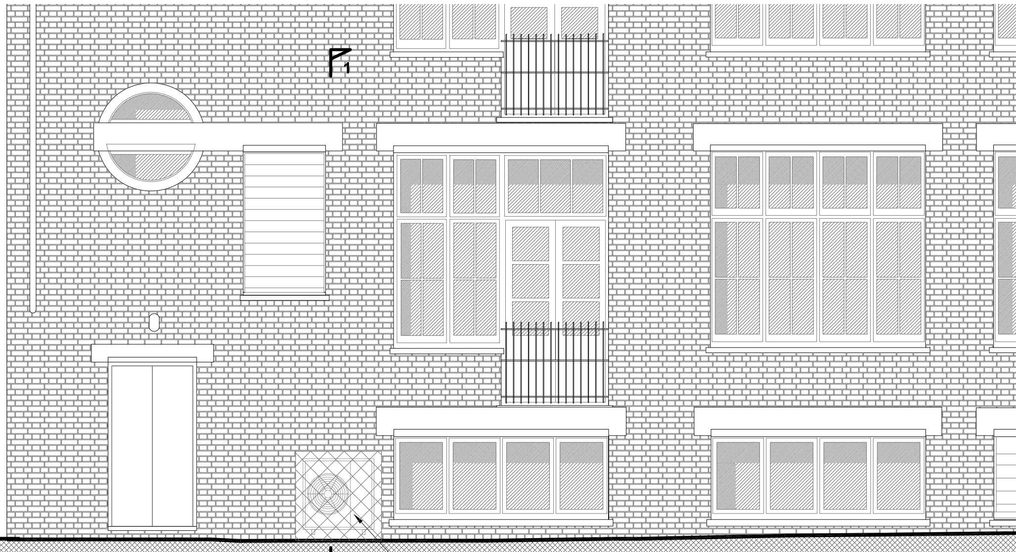
PROPOSED PARTIAL ELEVATION 1:50@A3