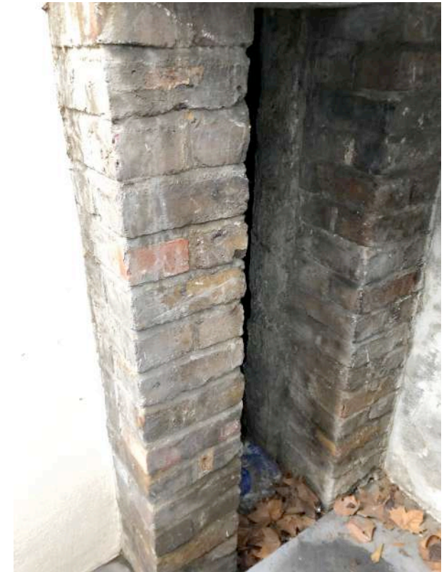
PHOTOGRAPH 03. VIEW OF ENTRANCE TO VAULT