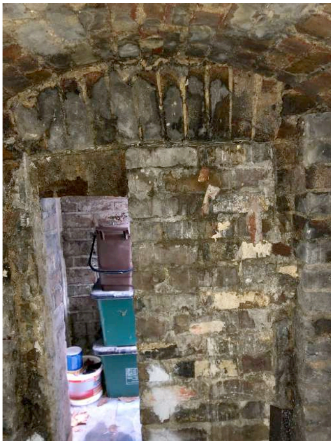
PHOTOGRAPH 04. INTERNAL VIEW OF VAULT