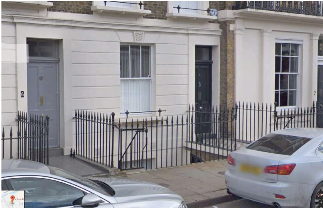
PHOTOGRAPH 01. STREET VIEW