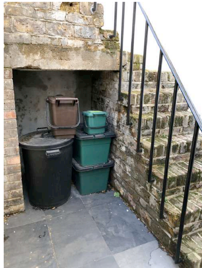
PHOTOGRAPH 05. VIEW OF STAIR