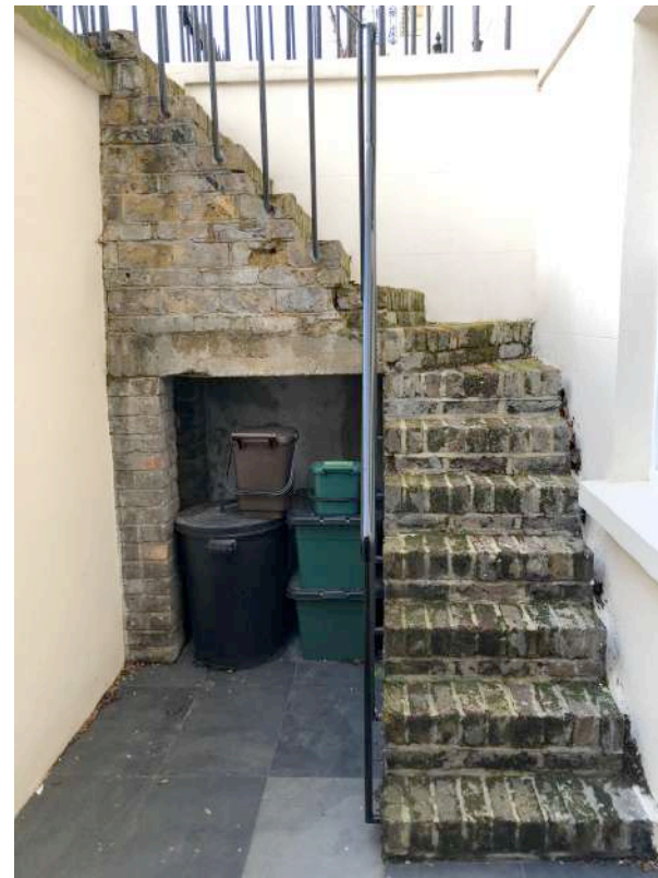
PHOTOGRAPH 02. VIEW OF MODERN BRICK STAIR FROM LIGHTWELL