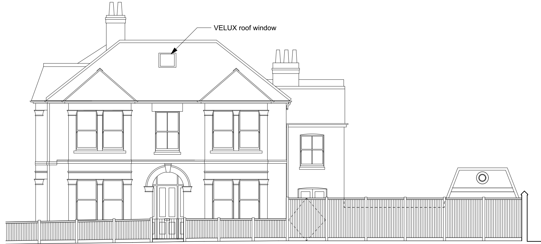
2 EAST ELEVATION