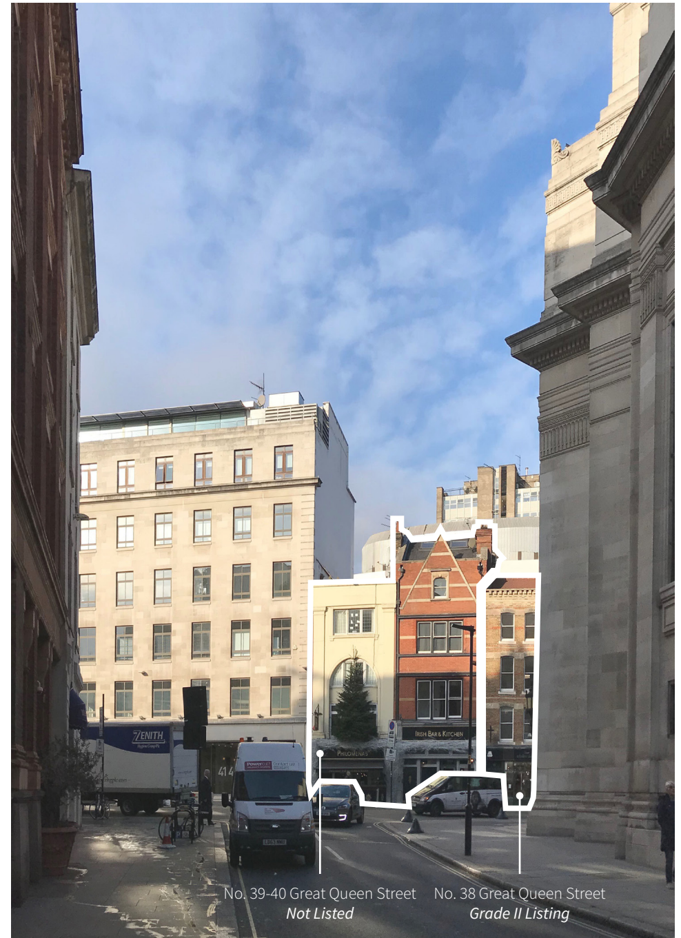
No. 39-40 Great Queen Street Not Listed No. 38 Great Queen Street Grade II Listing