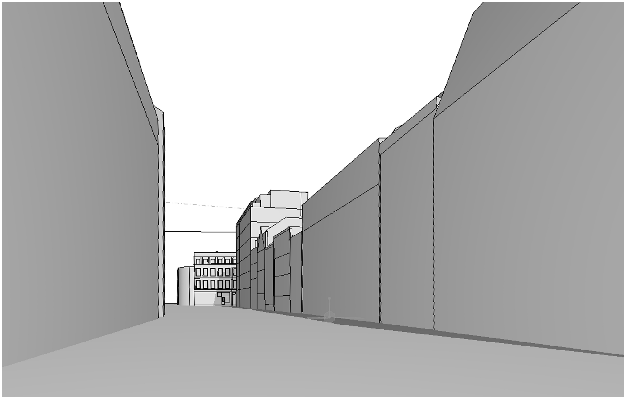
View from Great Queen Street: Proposed