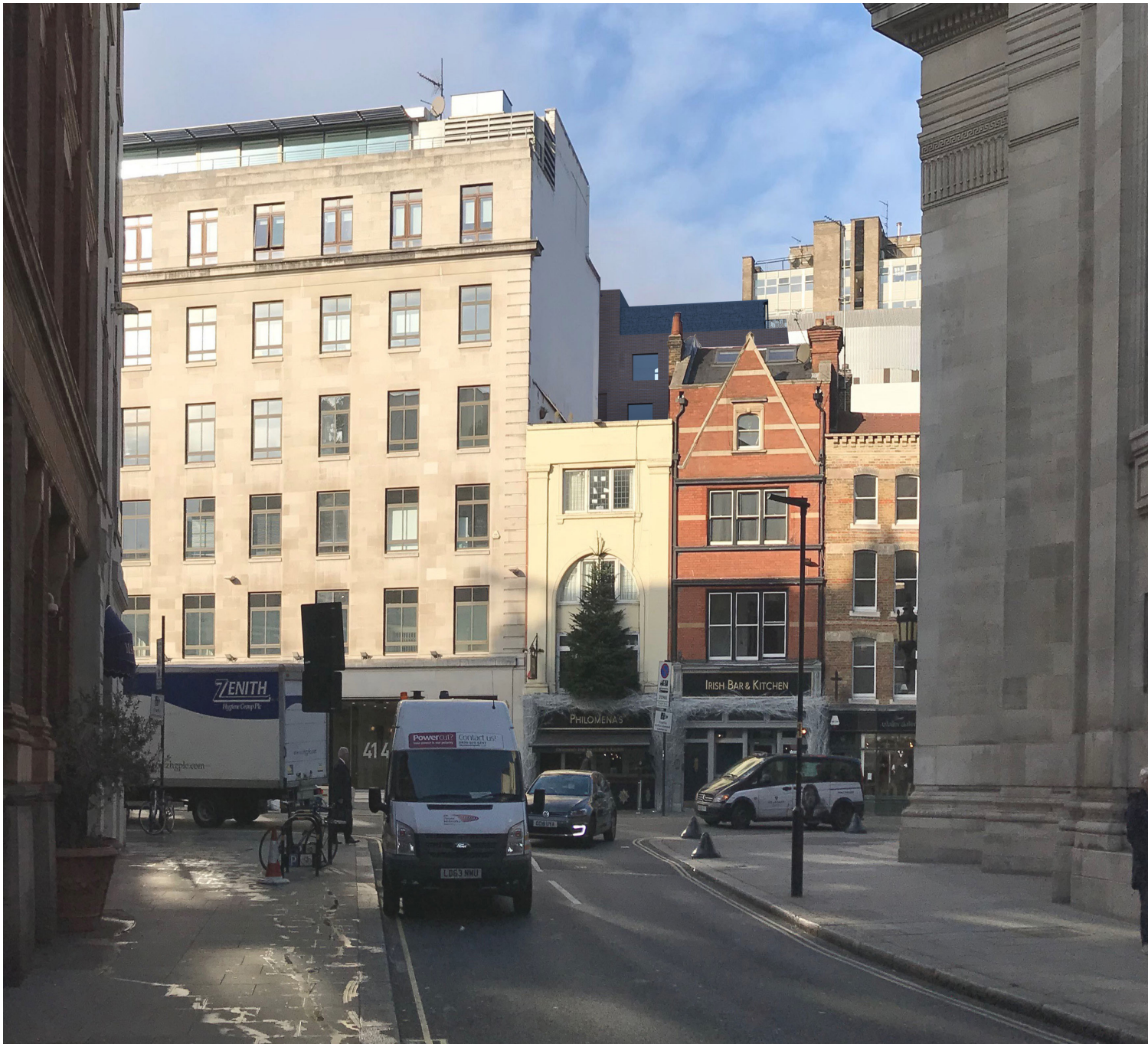
160-161 Drury Lane Seven Dials Conservation Area Views