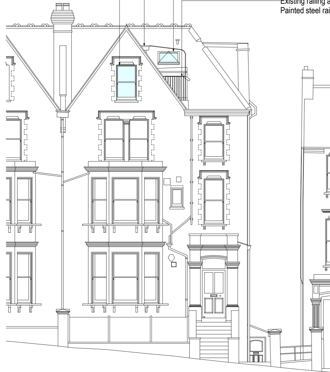
FRONT ELEVATION: AS PROPOSED