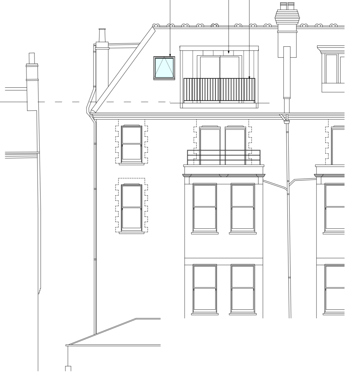
REAR ELEVATION: AS PROPOSED