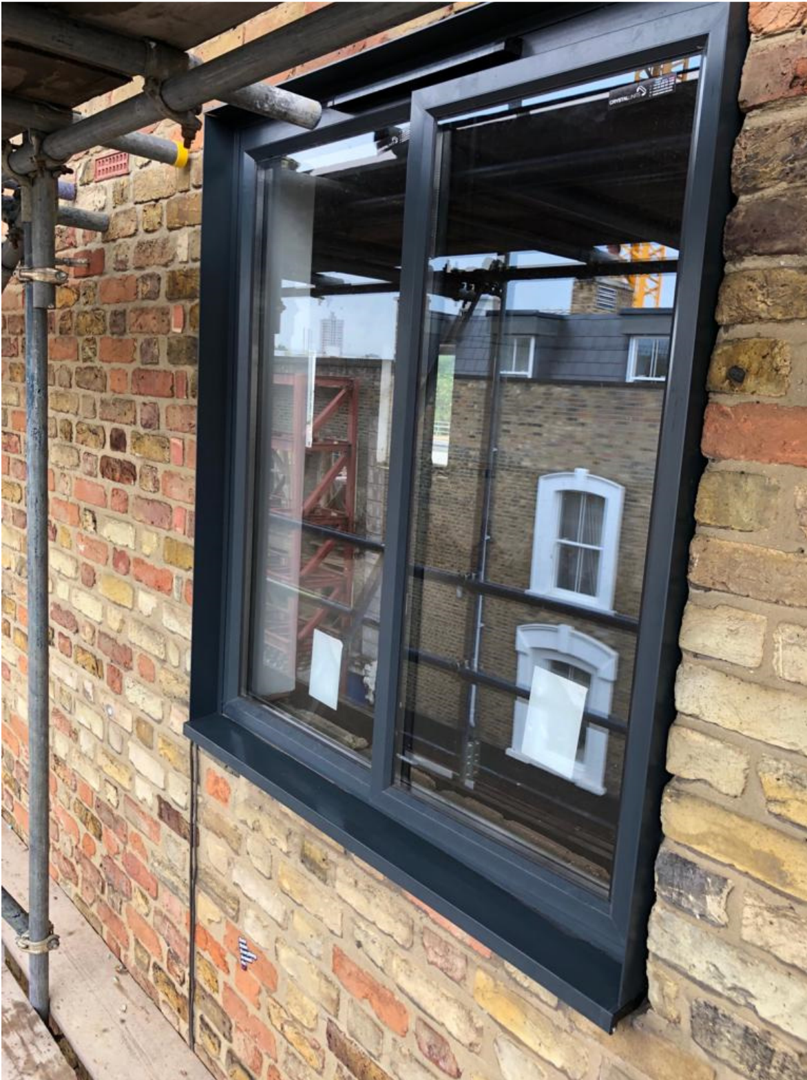
Fig 2 - Glazing, frame and flashing PPC RAL 7016