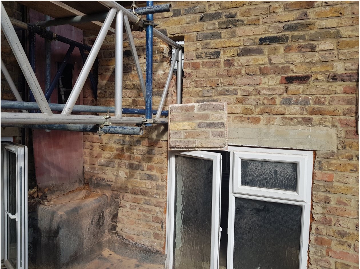
Fig 1 - Reclaimed Brick Sample