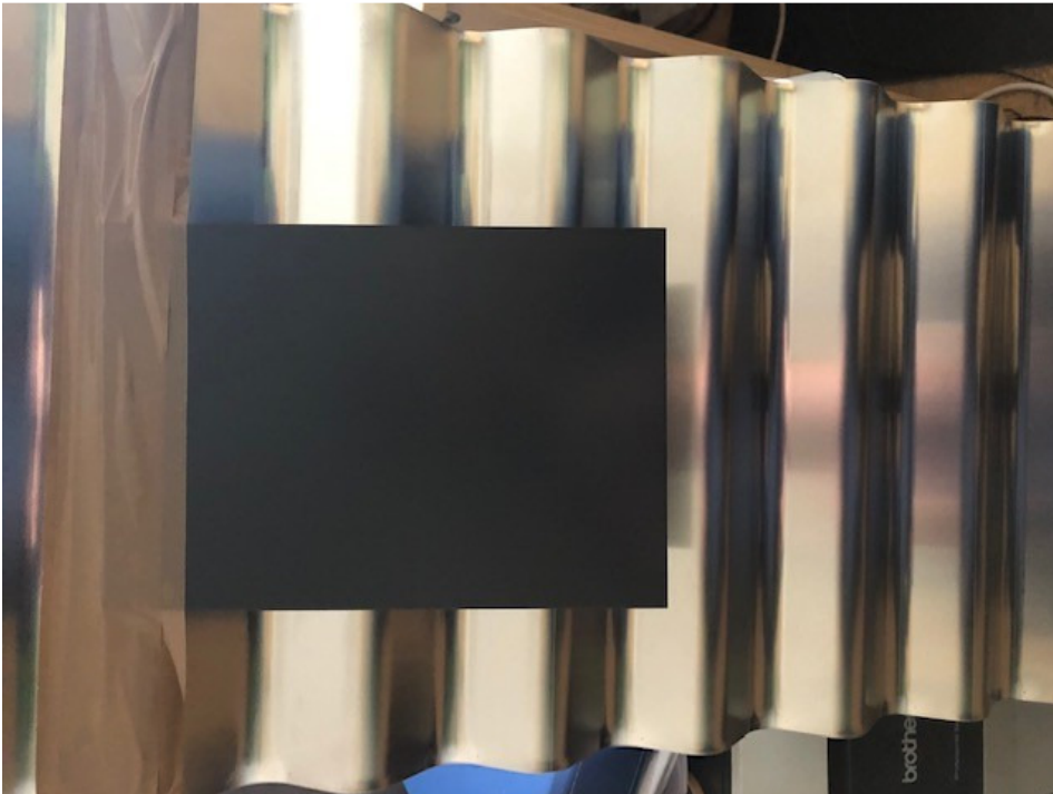
Fig 4 – Corrugated metal cladding and PPC 7016 colour sample