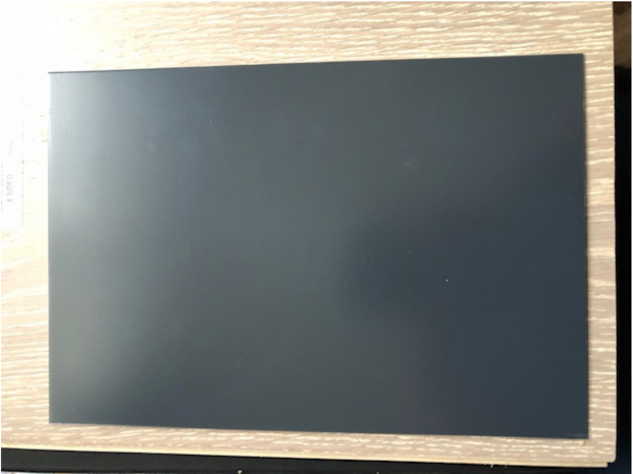
Fig 3 – Metal flashing PPC RAL 7016 for wall capping