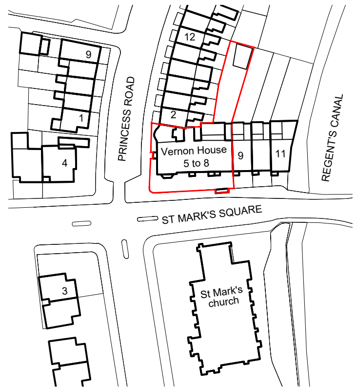
01 Site location plan 1:1250 @ A3