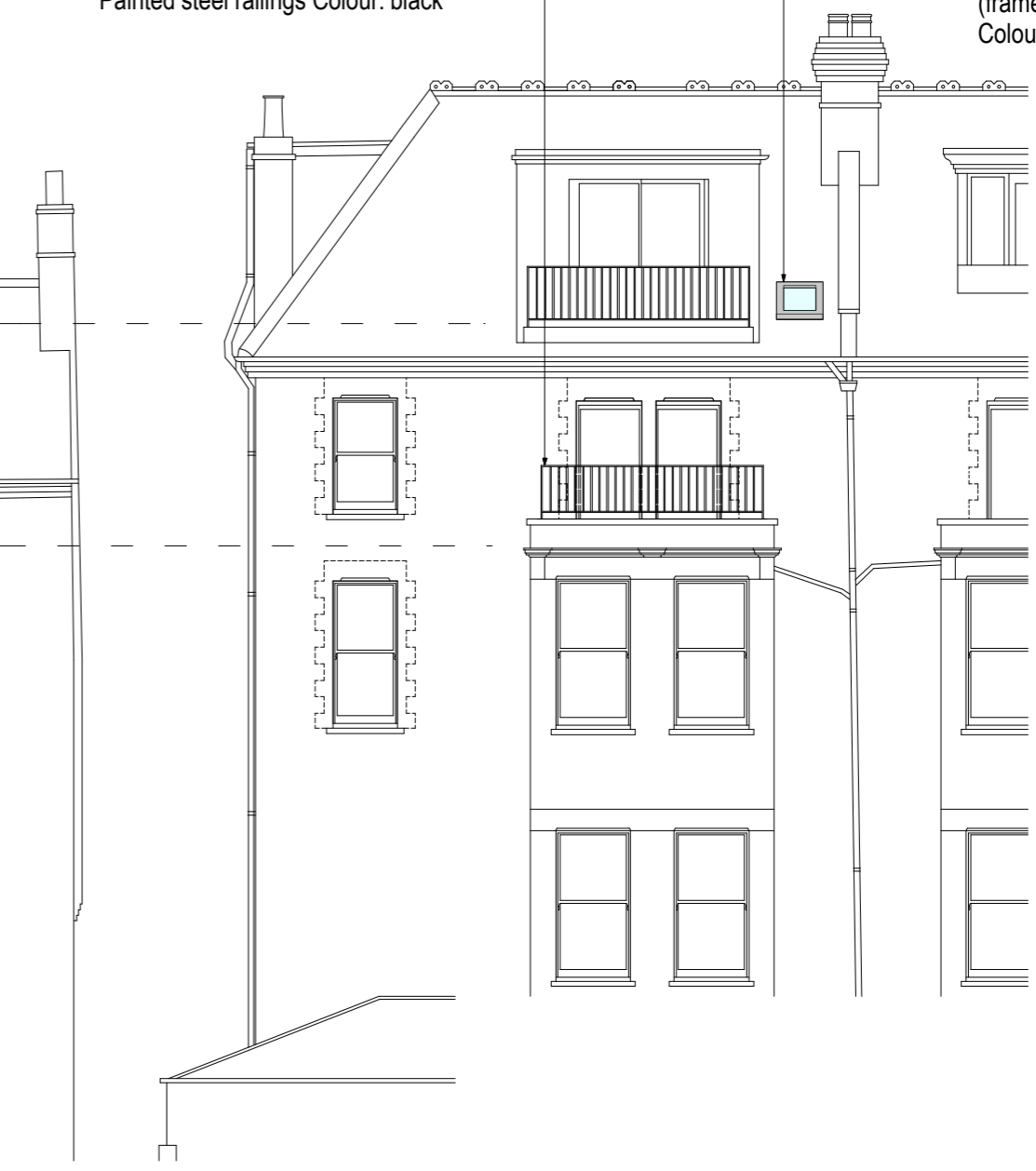
REAR ELEVATION: AS PROPOSED

Existing railing altered: Height increased to meet current building regulations. Painted steel railings Colour: black