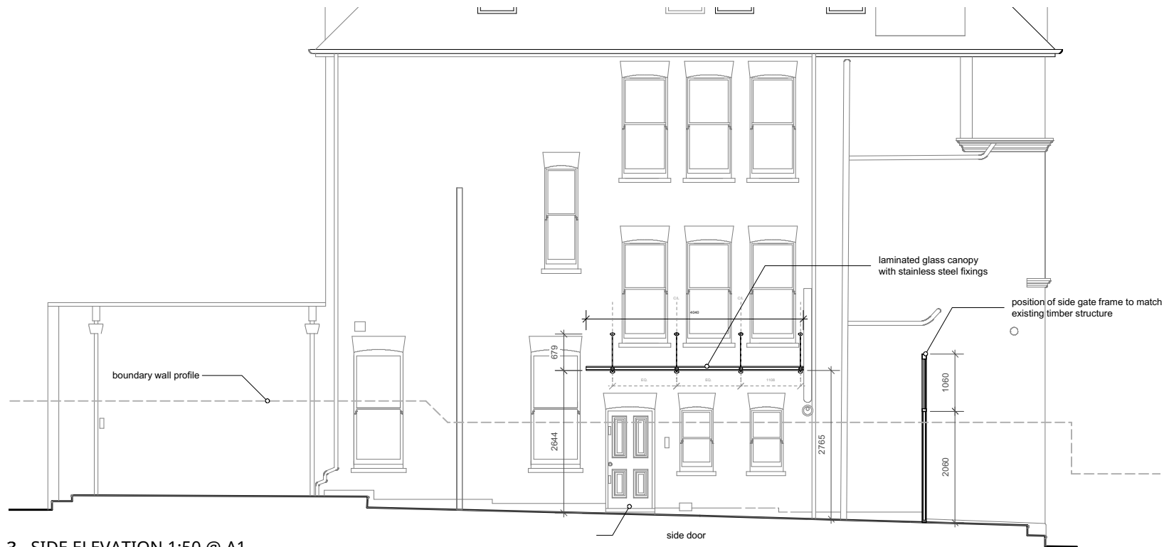
3. SIDE ELEVATION 1:50 @ A1