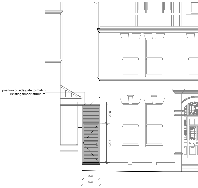
2. SIDE GATE PROPOSED ELEVATION 1:50 @ A1