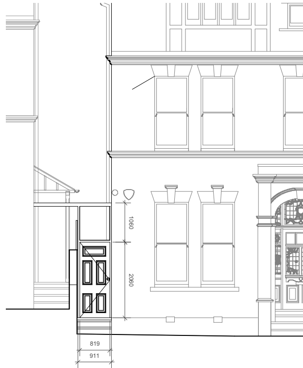
1. SIDE GATE EXISTING ELEVATION 1:50 @ A1