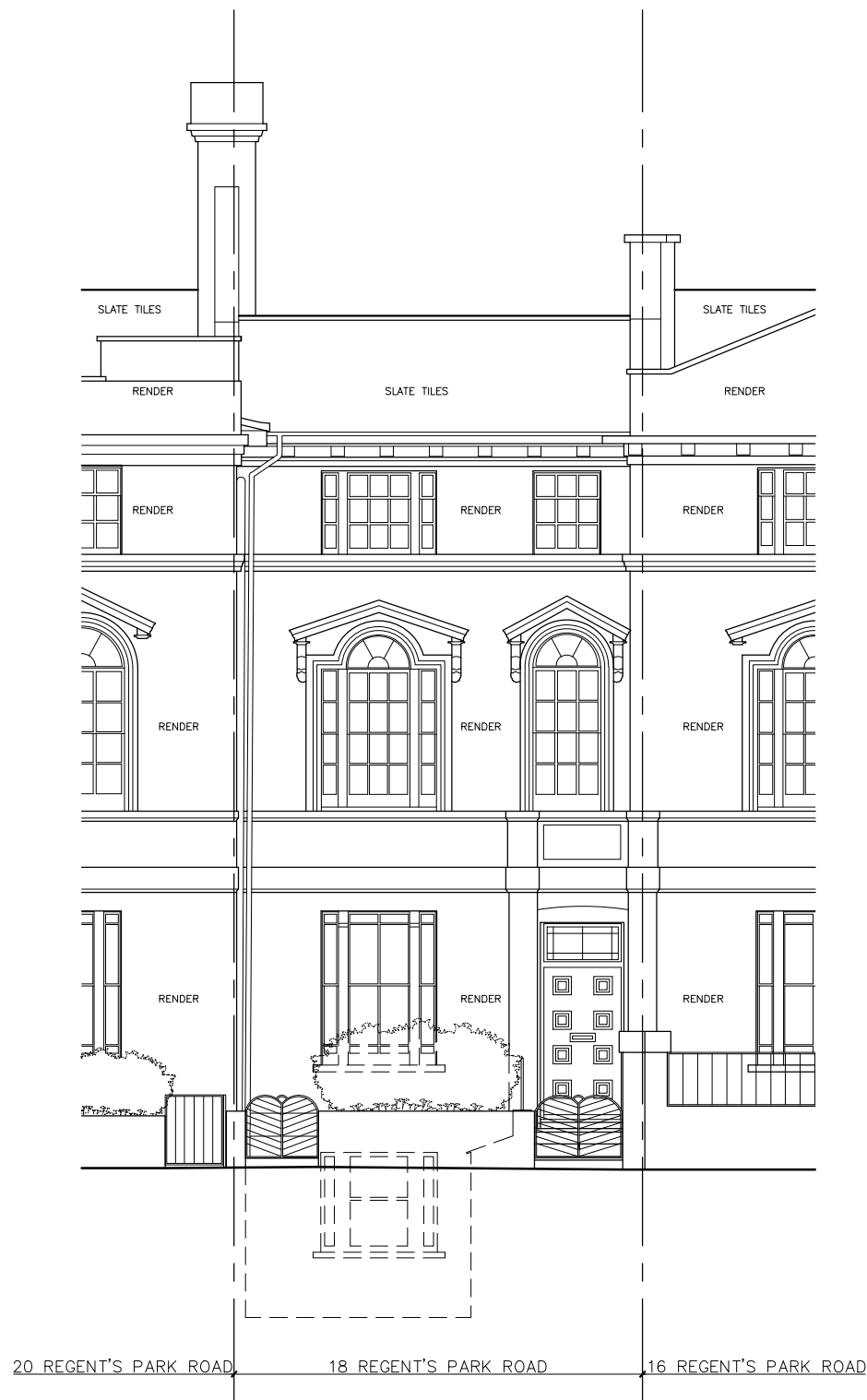
SOUTH ELEVATION (FRONT)