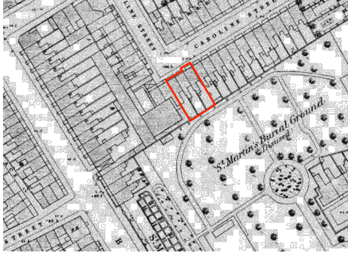
ORDNANCE SURVEY 1873