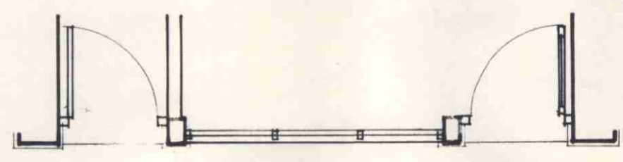
PLAN OF SHOPFRONT