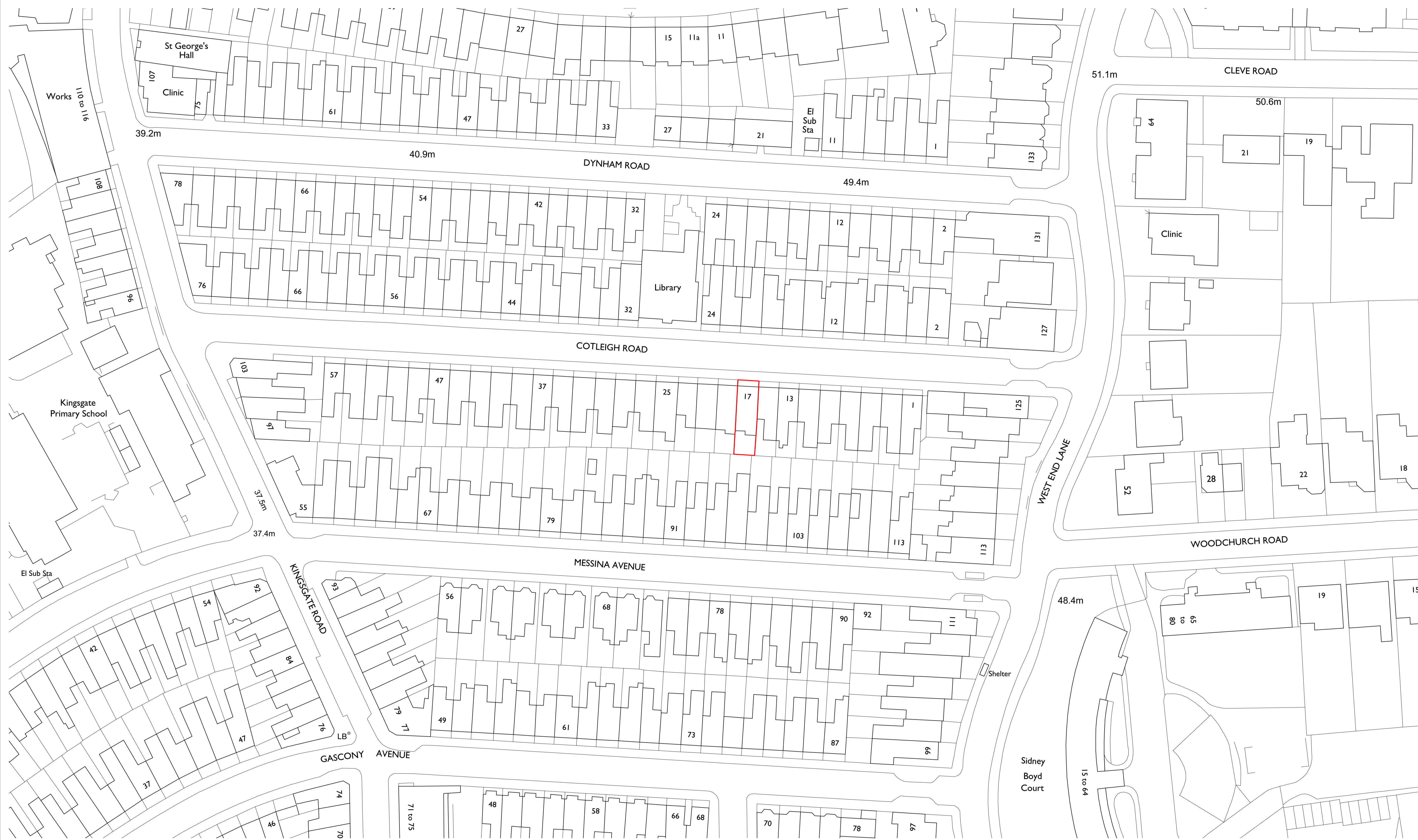
1 SITE LOCATION PLAN

GENERAL NOTE THE PROPOSAL HAS BEEN APPROVED UNDER APPLICATION 2018/2450/P. THE RESUBMITTED PROPOSAL INCLUDES A MINOR AMENDMENT BUBBLED IN RED.