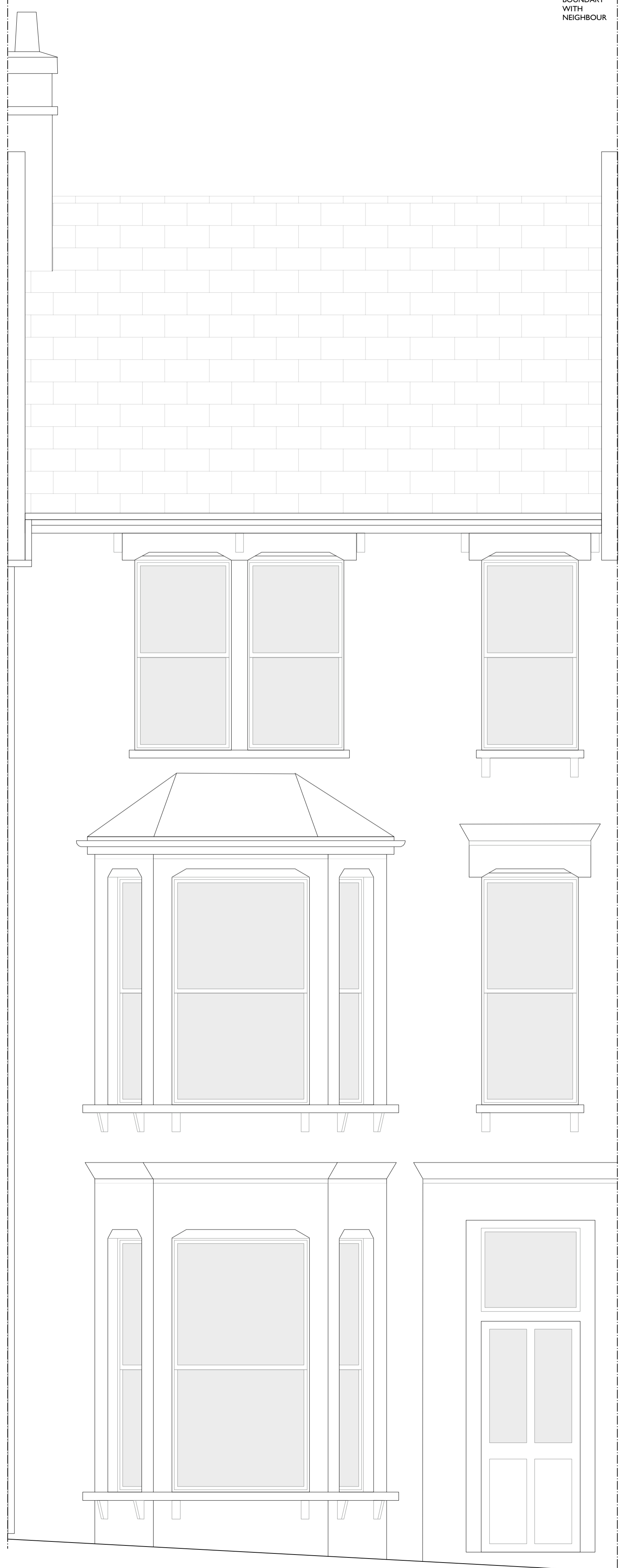
1 EXISTING NORTH ELEVATION AS PROPOSED